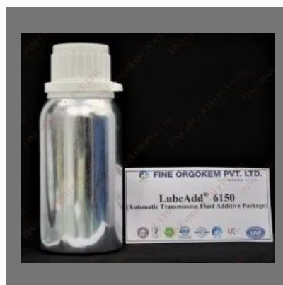
Automatic Transmission Fluid Additive