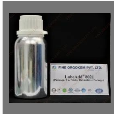
Passenger Car Motor Oil Additive (PCMO)