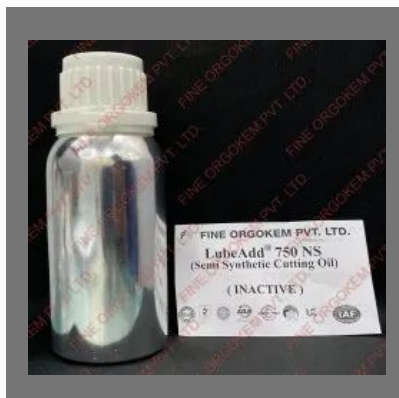
Semi Synthetic Cutting Oil Additive