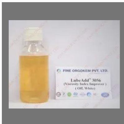
Viscosity Improver VI ( Off. White )