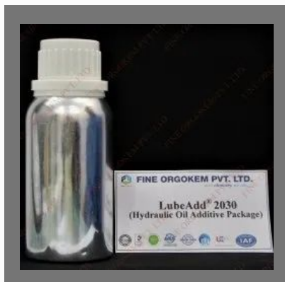
Hydraulic Oil Additive