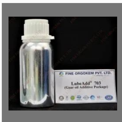
Gear Oil Additive