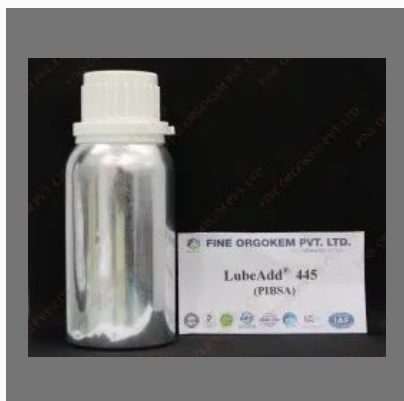
PIBSA (Succinic Anhydride)