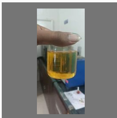
Dimer Fatty Acid