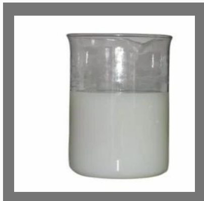
Industrial Silicone Defoamer