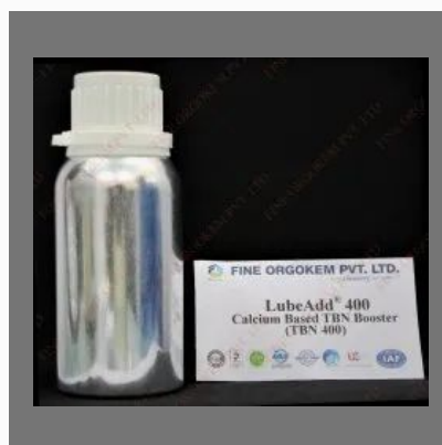
Calcium Based TBN Booster