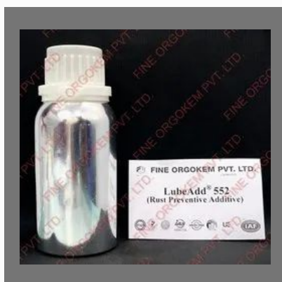
Rust Preventive Additive Package