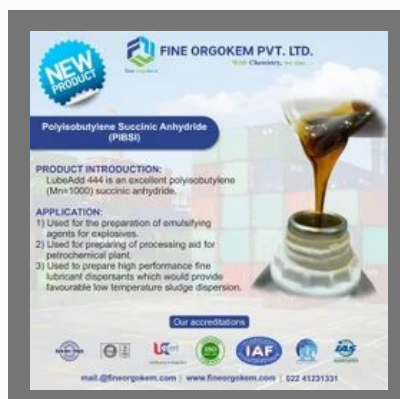
Lube add 454 Ashless dispersant (PIBSA)