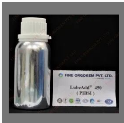
Ashless Dispersant Additive