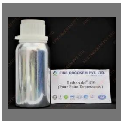
Pour Point Depressant