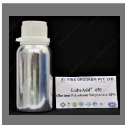
Barium Petroleum Sulfonate