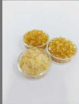
Non Reactive Polyamide Resins (alcohol soluble)