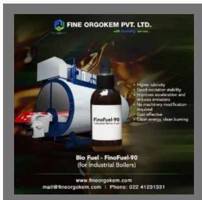
Industrial Finofuel -90