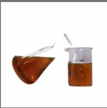
Polyamide Resins Reactive (Hardener)