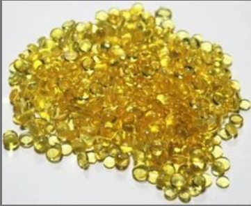
Non Reactive Polyamide Resin (Co-solvent soluble)