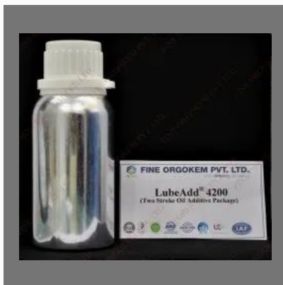
2 Stroke Engine Oil Additive