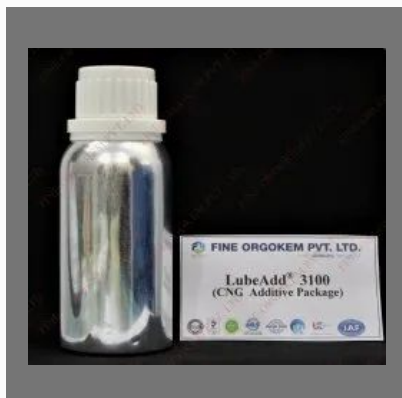
CNG Engine Oil Additive