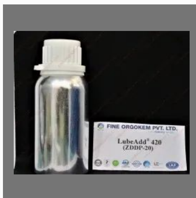
ZDDP 20 (Zinc Dialkyl Dithiophos Phates)