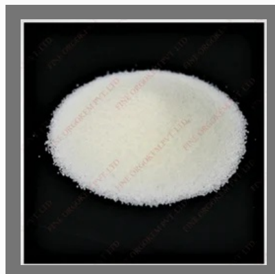
Ketonic Resin Granules