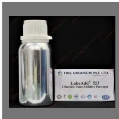
Thermic Fluid Additive