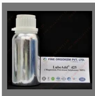
Magnesium Petroleum Sulfonate