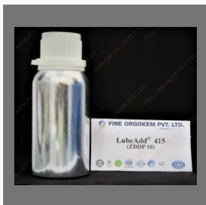
ZDDP 10 (Zinc Dialkyl Dithiophos Phates)