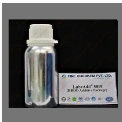
Heavy Duty Diesel Engine Oil Additive (HDDO)