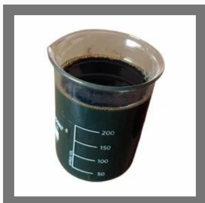
Boiler Fuel Oil