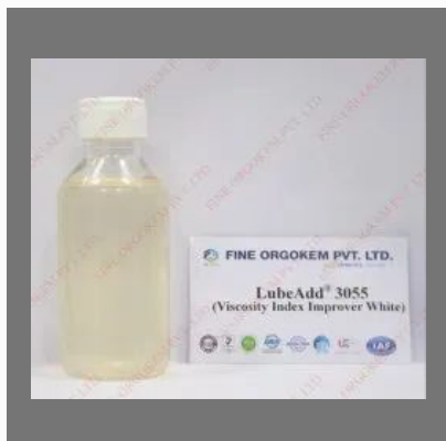
Viscosity Index Improver