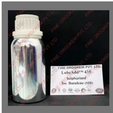
Sulfurized Iso Butylene (SIB)