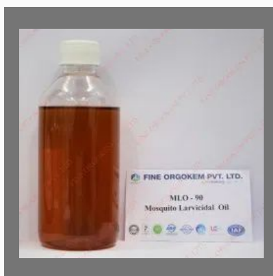
Mosquito Larvicidal Oil FLO-90