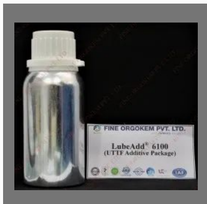
Universal Tractor Transmission Fluid Additive