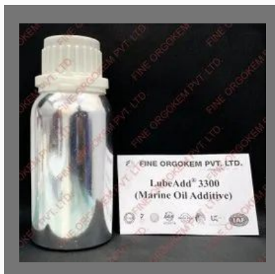
Marine Engine Oil Additive