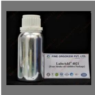
4 Stroke Engine Oil Additive