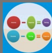
Savings Planning Service