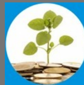
Investment Planning Service