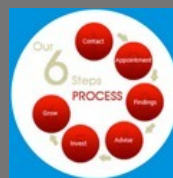
Financial Understanding Planning Service