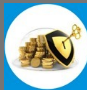
Financial Security And Mastery Planning Service