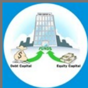
Capital Financial Planning Service