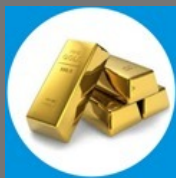
Assets Planning Service