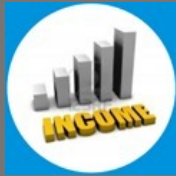
Income Planning Service