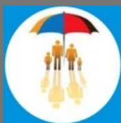
Family Security Planning Service