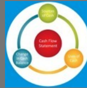
Cash flow Planning Service