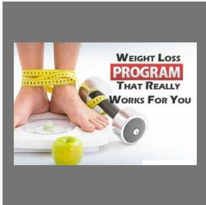
Weight Loss Fitness