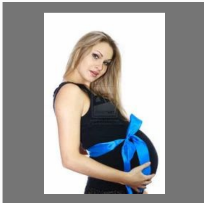
Pregnancy Fitness Clubs