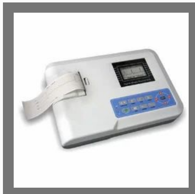
Three Channel ECG Machine