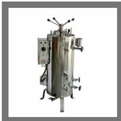
High Pressure Autoclave