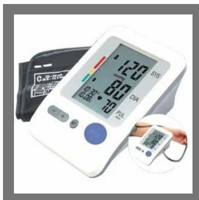
Digital Blood Pressure Monitor