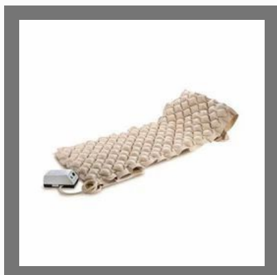
Anti Decubitus Air Mattress