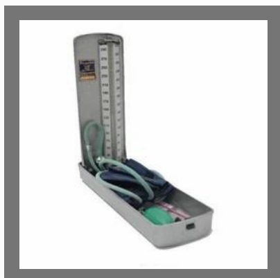
Mercurial BP Apparatus