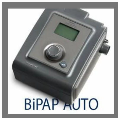
Bipap Auto Machine