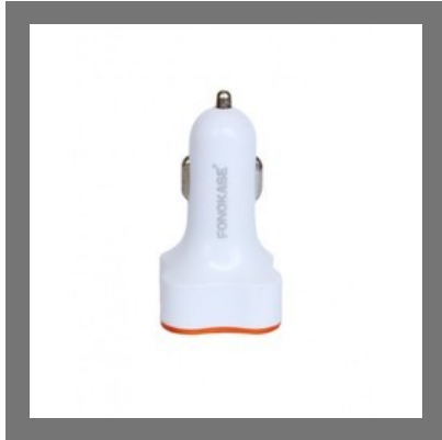
3 Port Car Charger