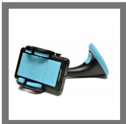
Fonokase Car Mobile Holder