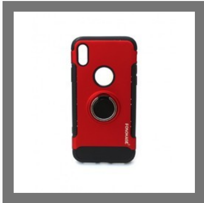
Apple iPhone X Ring Case