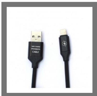
Power Bank USB Cable