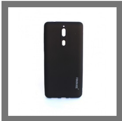
Nokia 8 Mobile Back Cover