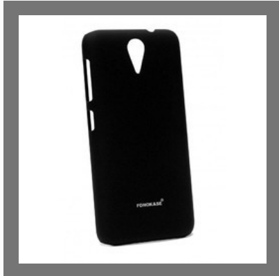
HTC 620 Mobile Case