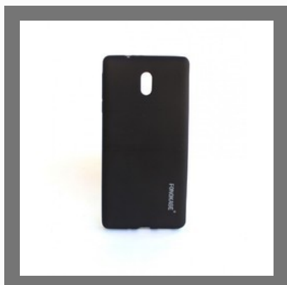
Nokia 3 Mobile Back Cover