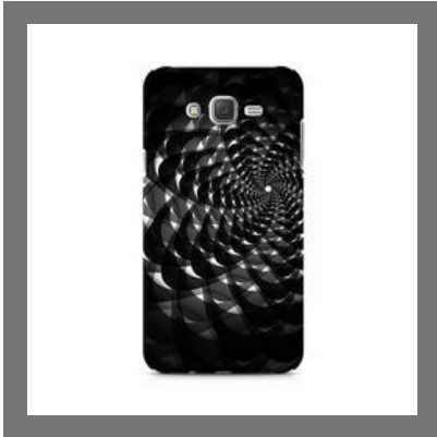
Samsung J1 Back Cover