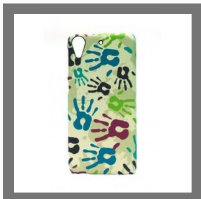
HTC Desire 626 Mobile Case