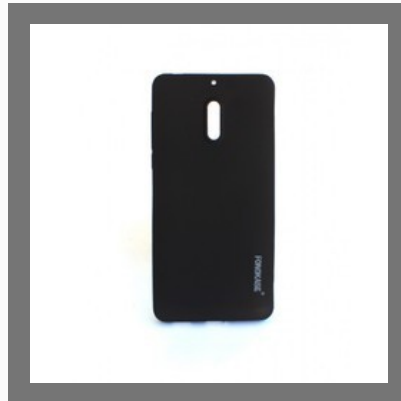
Nokia 6 Mobile Back Cover