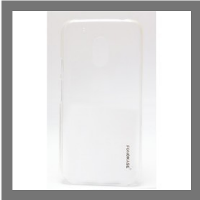
Moto G4 Plus Case