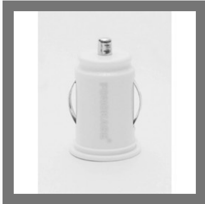
Fonokase Dual USB Mini Car Charger