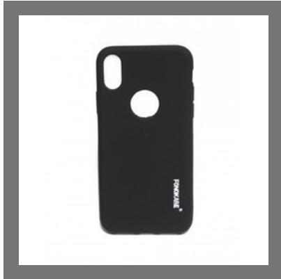
Apple iPhone X Plain Case