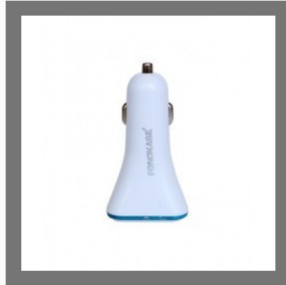
4 Port Car Charger