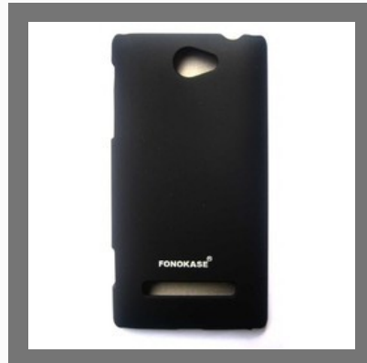
HTC 8 S Mobile Case