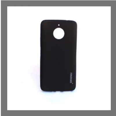
Moto E4 Plus Case