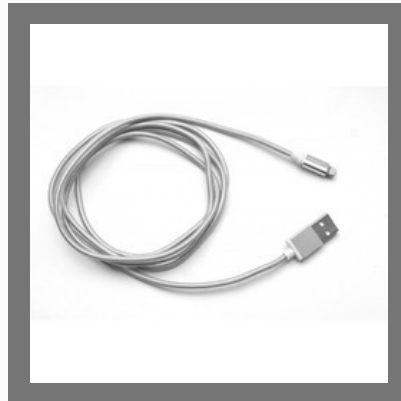
Iphone USB Cable