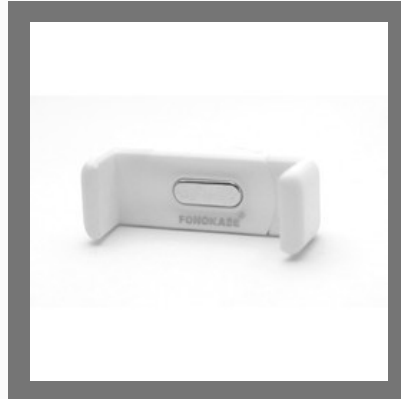
Plastic Car Mobile Holder