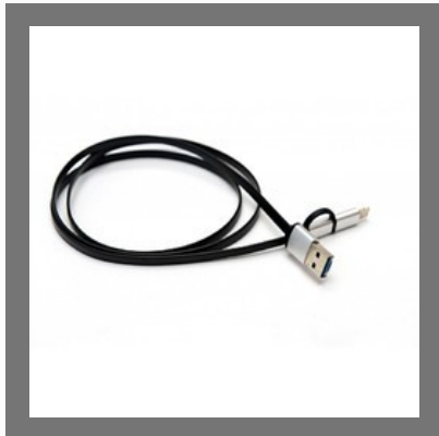
2 In 1 USB Cable