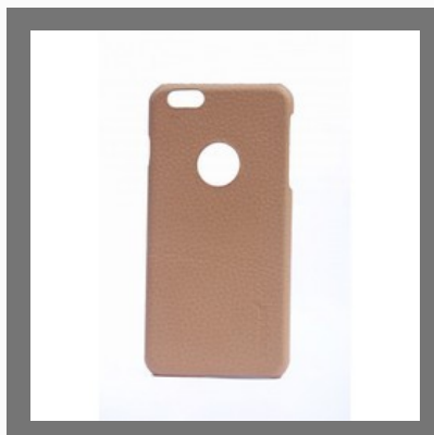
Apple iPhone 7 Plain Case