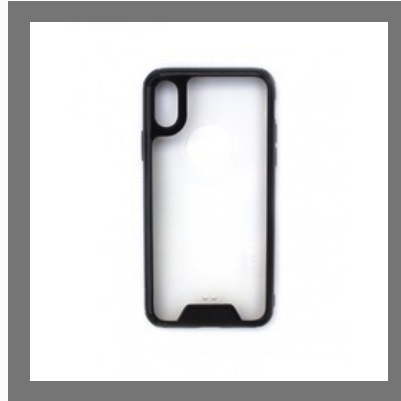
Apple iPhone X Transparent Case