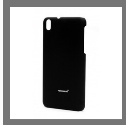
Black HTC Mobile Case