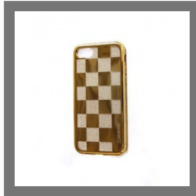
Apple iPhone 7 Designer Case