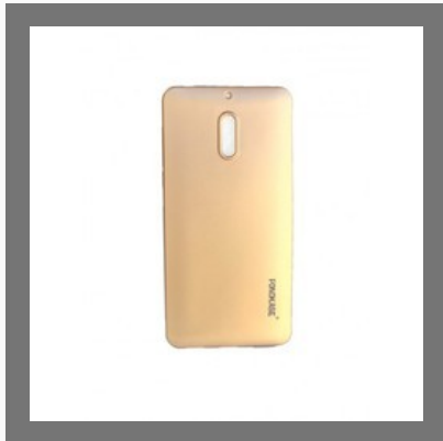
Nokia 5 Mobile Back Cover