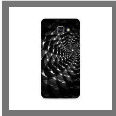
Samsung A7 Back Cover