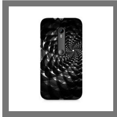
Moto X Play Case