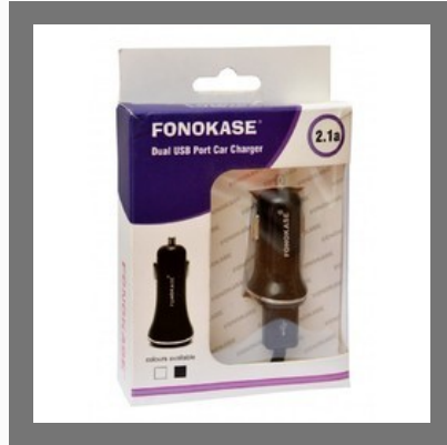
Combo Car Mobile Charger