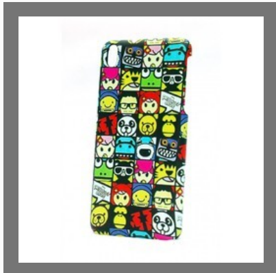
HTC Desire 816 Mobile Case