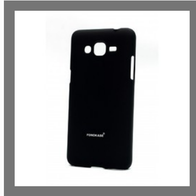
Samsung Galaxy Grand Prime Back Cover