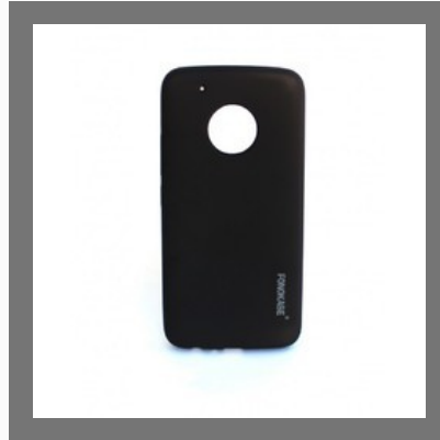
Moto G5 Plus Case