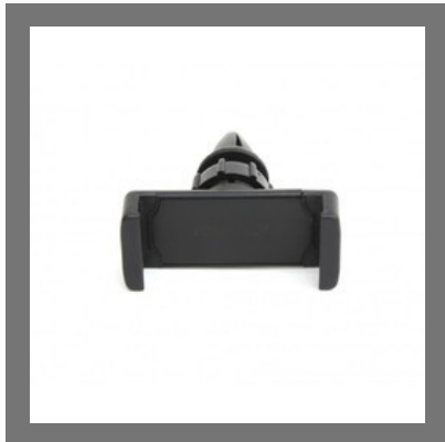
Car Vent Mobile Holder