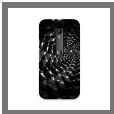
Moto G3 Case