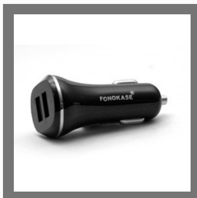
Dual USB Car Charger