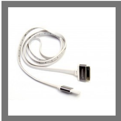
30 Pin USB Cable