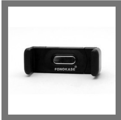
Black Car Mobile Holder