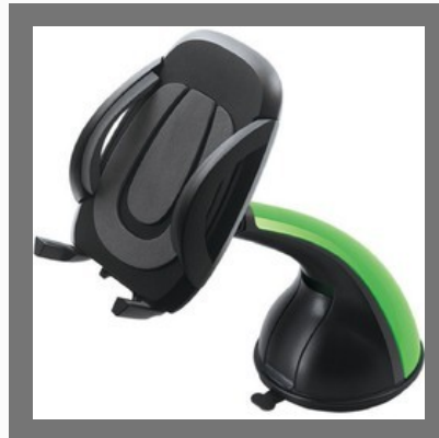
Car Mount Mobile Phone Holder