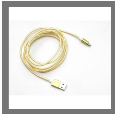
Micro USB Cable