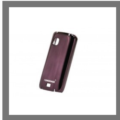
Nokia C5-03 Mobile Back Cover