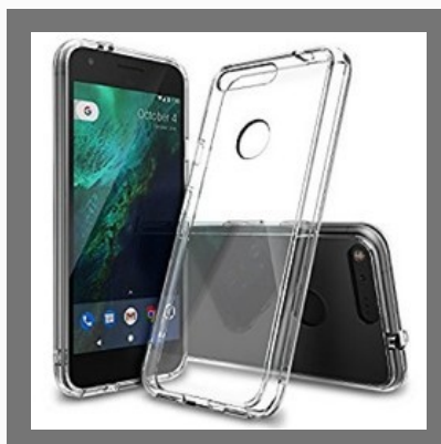
Samsung Galaxy A9 Pro Back Cover