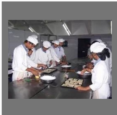
Food And Beverage Service