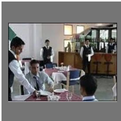
Bakery And Confectionary