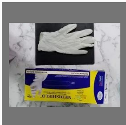
Disposable Surgical Gloves