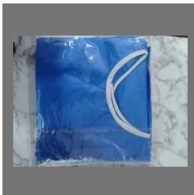
Blue Surgical Kit