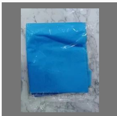
COVID- 19 Disposable BedSheet