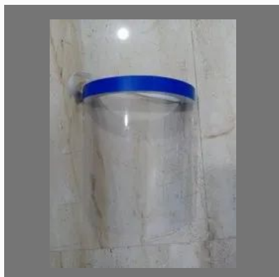
Full Face Shield