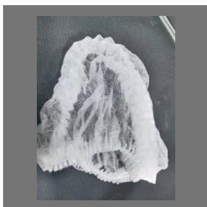
COVID- 19 Head Cover