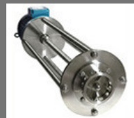
High Speed Emulsifier