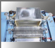
Three Roll Mill