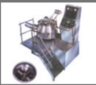
Rapid Mixer Granulators