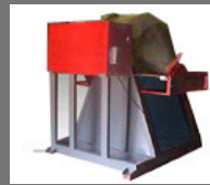
Double Cone Blender