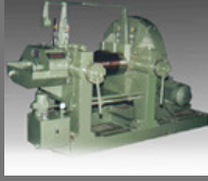
Two Roll Mills