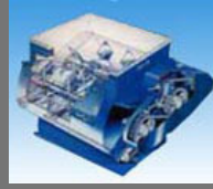
Fluidized Zone Mixer