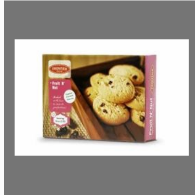
Fruit And Nut Cookie Pack