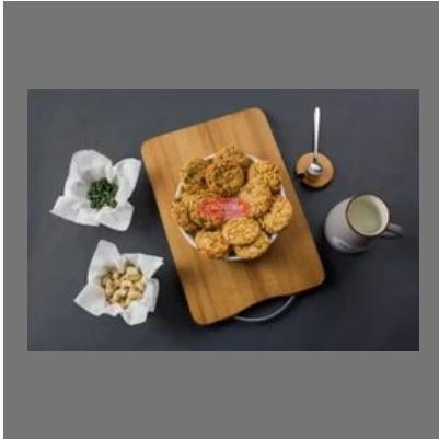
Dry Fruit Biscuit