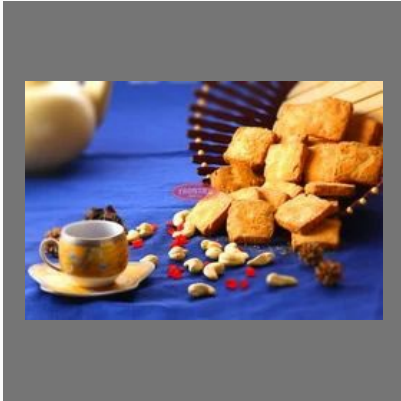
Fruit Kaju Biscuit