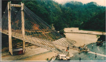
Tallest Cooling Tower