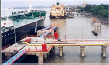
Dolphin Jetties at RM-5 & RM-6