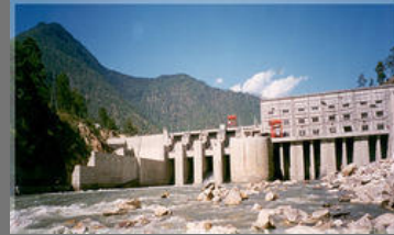
Kurichu Power House