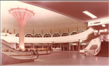
Terminal Building For Sharjah International Airport