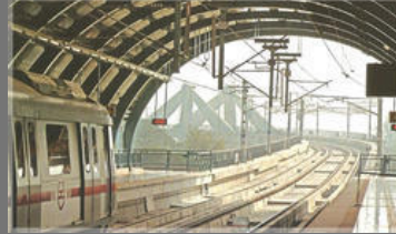
Elevated Viaducts For Delhi Metro Rail Corporation