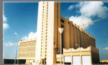
Derna and Baida Grain Silo