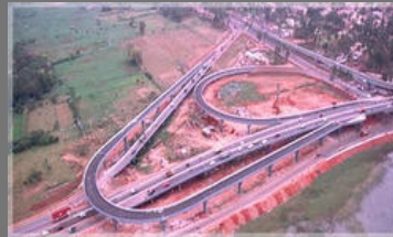
Bangalore Development Authority - 5.3km