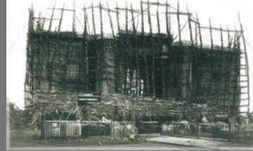
Construction Of The Foundations Of The Gateway