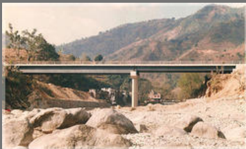
22 Bridges in Nepal