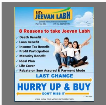
Lic Jeevan Labh