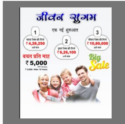
Jeevan Sugam Policy