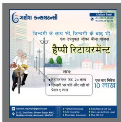
Retirement Planning Services