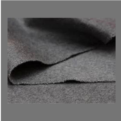
Grey Coat Cloth