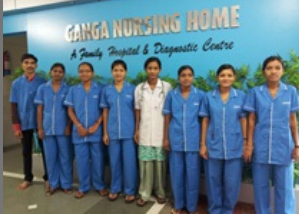
Paramedical Staffing Service