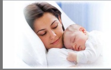
Obstetric And Gynecological Service