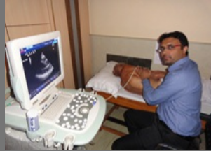
2d Echo & Cd Service