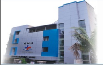
Internal Medicine Service