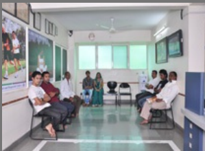
Waiting Area Service