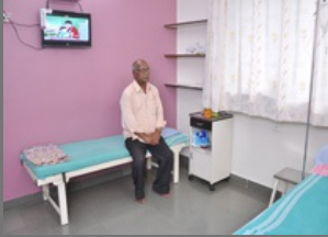
Special Room Service