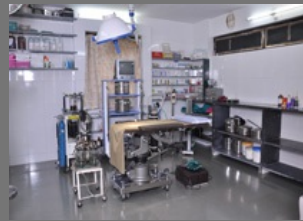
Operation Theatre Service