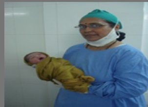
Baby Care Service