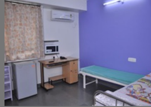
Delux Room Service