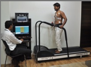
Tread Mill Test Service