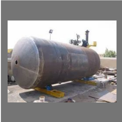
Pressure Vessel Tank