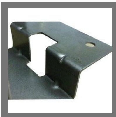
Sheet Metal Components