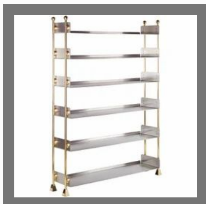
Customized Stainless Steel Rack