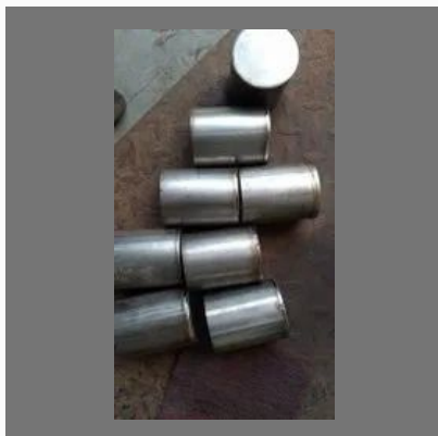
Cnc Laser Welding Services