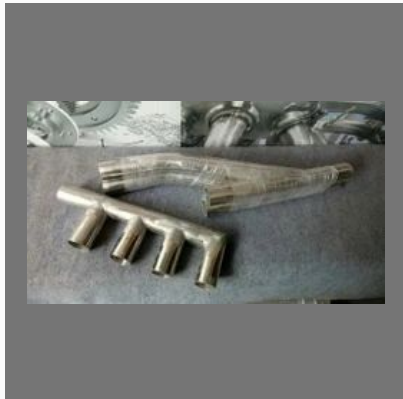
Threaded Pipe Tee Joint