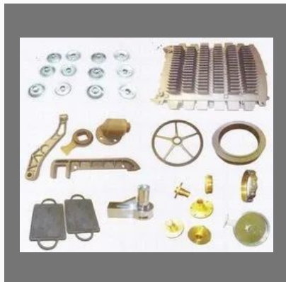
Die And Sand Castings