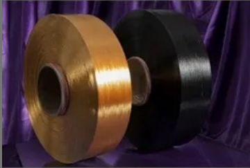
Polyester Filament Yarns