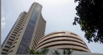
Capital Market Services