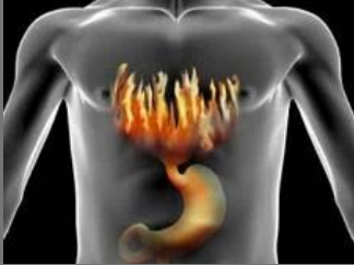
Acidity Treatment Service