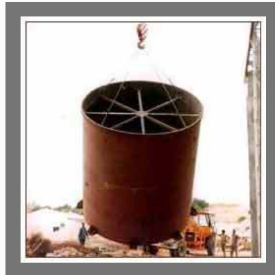
Silos Fabrication Services