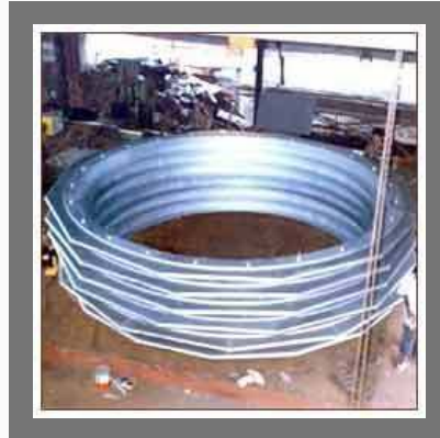
Expansion Joint Fabrication Services