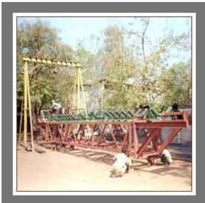
Conveyor Structure Fabrication Services