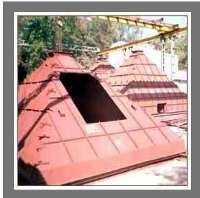
Hoppers Fabrication Services