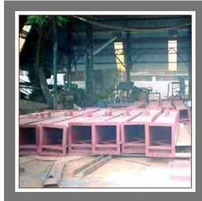
PG Conveyor Fabrication Services