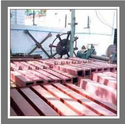
Air Slide Conveyor Fabrication Services