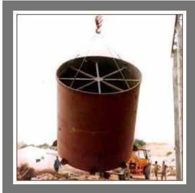
Silos Fabrication Services