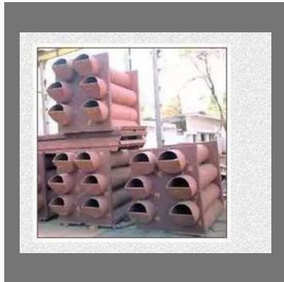
Gas Cooler Chambers