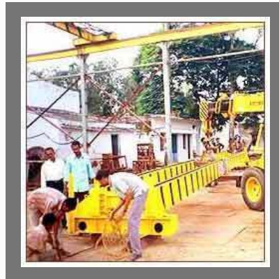
Heavy Structural Fabrication