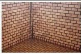
Brick Lining Service (BR)