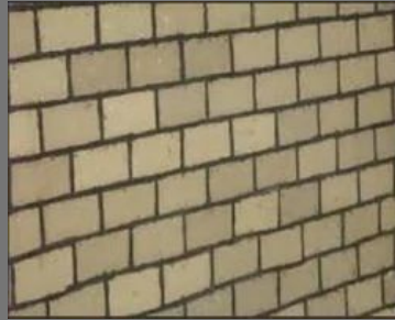
Tile Lining Service