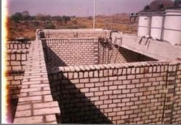
Red Mandana Stone Lining Service