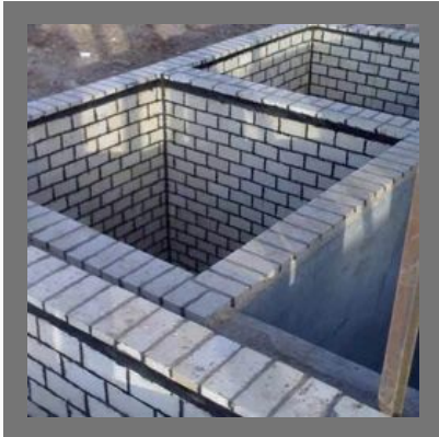
Gayrex Silicate Cement Mortar