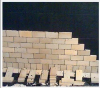
Acid & Alkali Resistant Cement Mortar