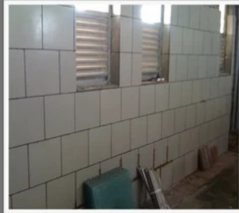
Acid & Alkali Resistant Silicate Cement