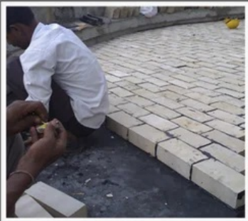
Graphite Carbon Filled Hydro Fluoric Resistant Mortar