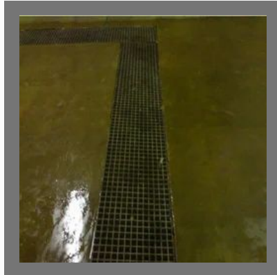
Gayfane Epoxy Resin Base Cement Mortar