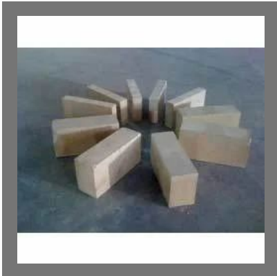
Acid Proof Bricks