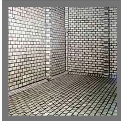
Gaybond Sulphur Base Cement Mortar