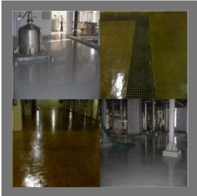
Epoxy Self Leveling