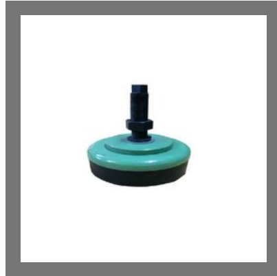
Rubber Machine Mount