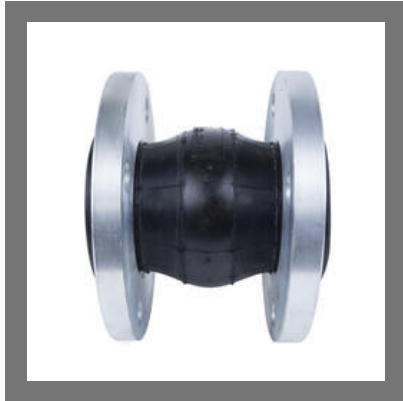
Rubber Expansion Joint