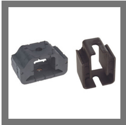
Double U Shear Mount