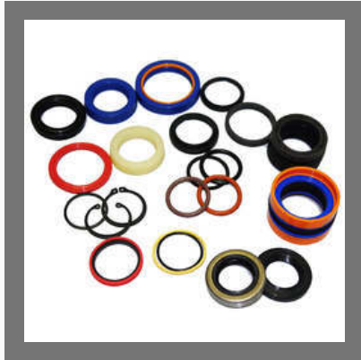
Silicone O Rings