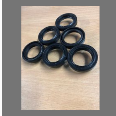
Rubber Oil Seal