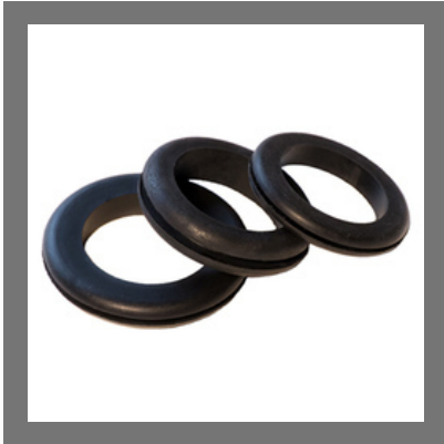
Natural Rubber Gasket