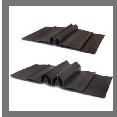
Parking Expansion Joint