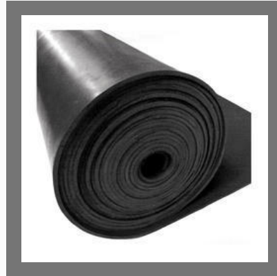
EPDM Rubber Sheet