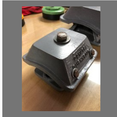
Gayatri Cushyfoot Mount type A