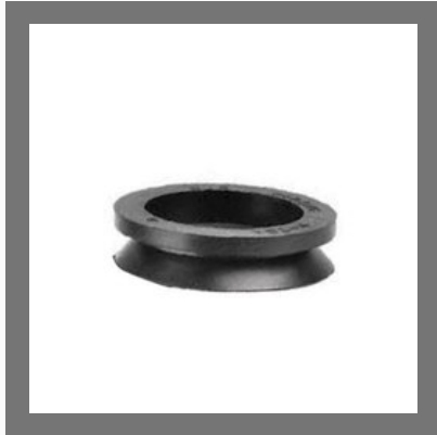
Rubber U And V Seals