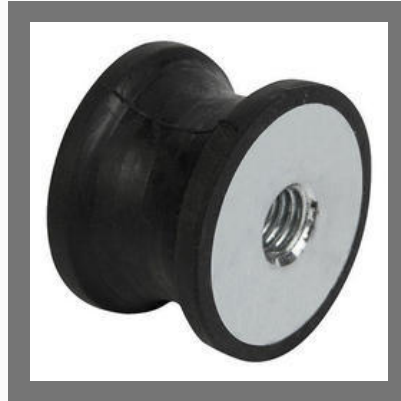
Anti Vibration Rubber Bobbin Mounts