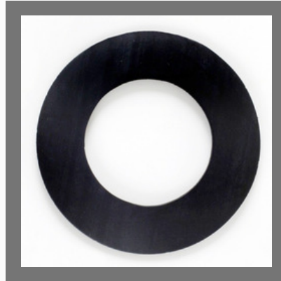
Viton Rubber Gasket