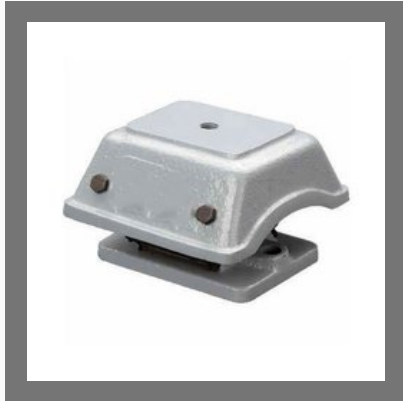
Cushy Foot Mount