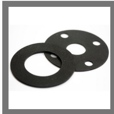
Neoprene Rubber Gasket