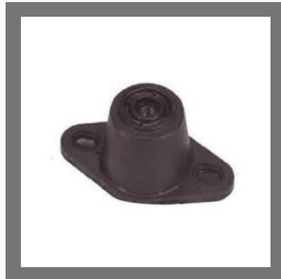
Rubber Comby Mount