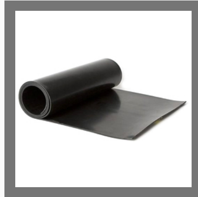
Neoprene Rubber Sheet