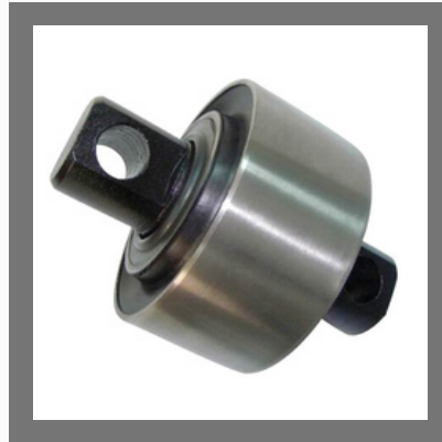
Torque Rod Bush