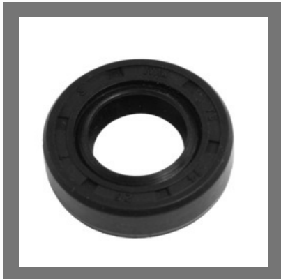
Nitrile Oil Seal