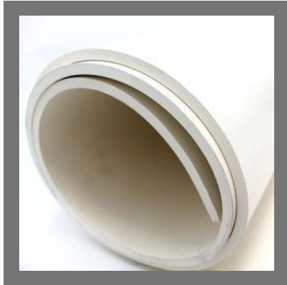
Silicone Rubber Sheet