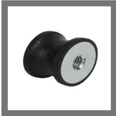
Rubber O Mount