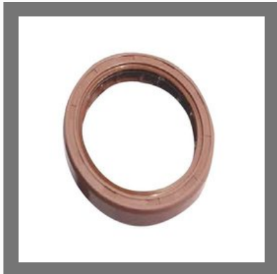
Rubber Oil Seals