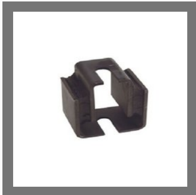
Rubber Double U Shear Mount