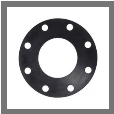
Flange Rubber Gasket