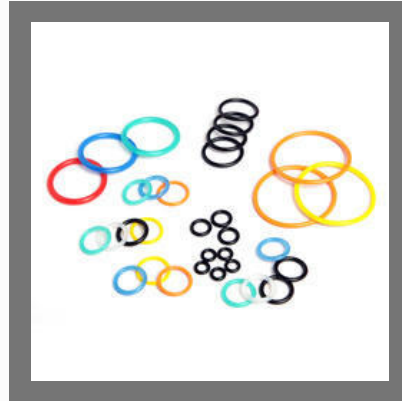
Silicone Rubber O Ring