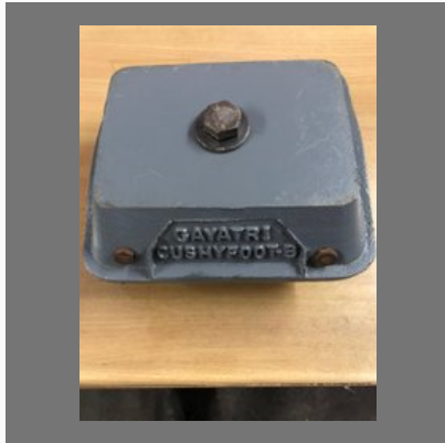
Cushy Foot Machine Mounting Type B