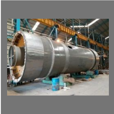
Ball Mill Shell