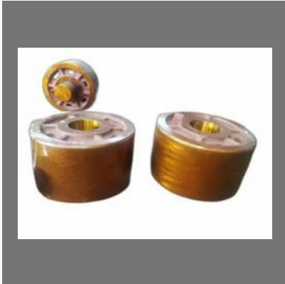
Kiln & Cooler Support Roller For Cement & Sponge Iron Plants