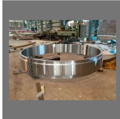
Klin Tyre /Riding Ring