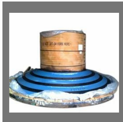
Mill Heads And Trunnions