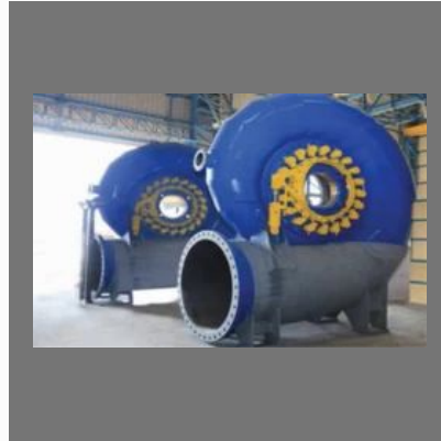
Hydro Power Equipment