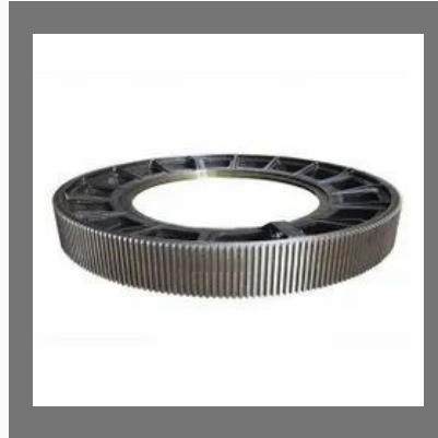
Kiln Girth Gear