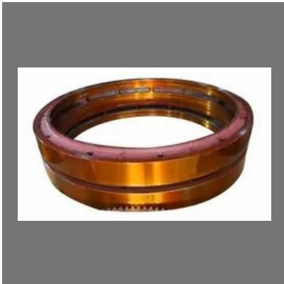
Mild Steel Sugar Mill Gear