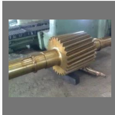
Integral Pinion Shaft