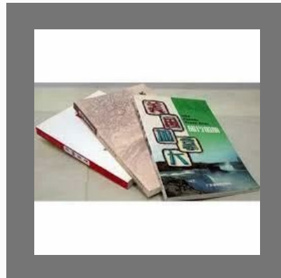
Booklet Printing Service