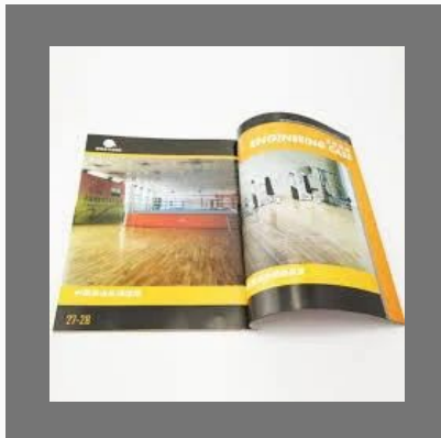
Journals Printing Services