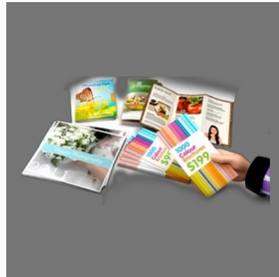
Leaflets Printing Services