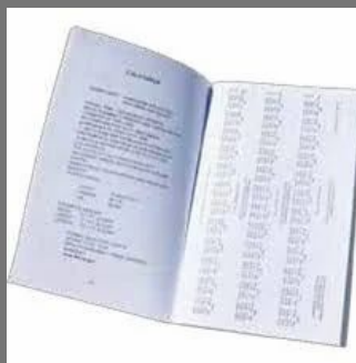
College Reference Book