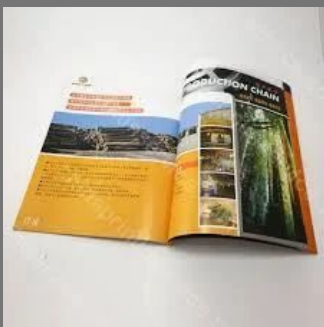
College Prospectus Printing Services