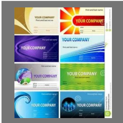
Visiting Cards Printing Services