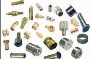
Precision Turned Components