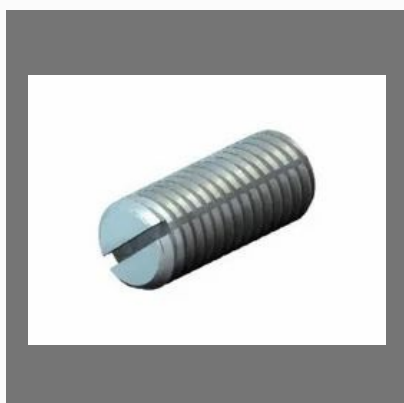
Slotted Grub Screw