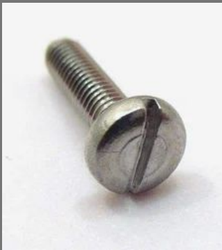
Pan Head Screw