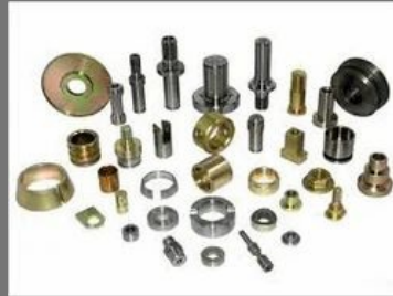
Precision Turned Parts