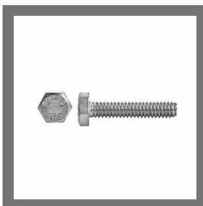
Stainless Hex Tap Bolts