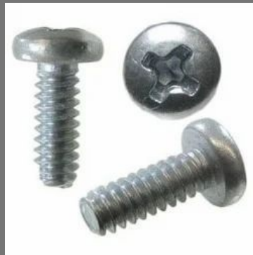
Philips Head Screw