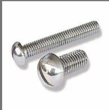
Round Head Screw