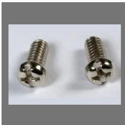
Combination Head Screw