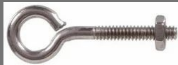
Stainless Eye Bolts