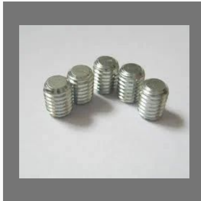
Flat Point Grub Screw