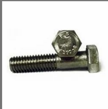
Stainless Hex Head Cap Bolts