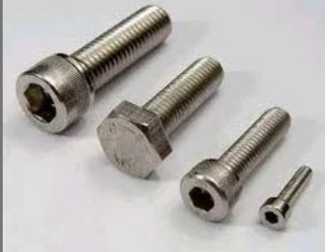
Stainless Steel Bolts