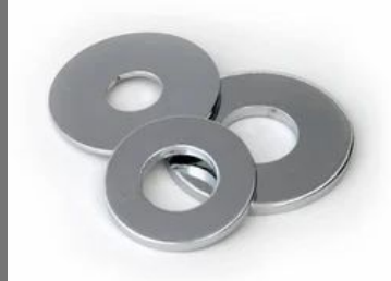
Stainless Steel Washers