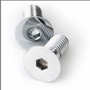
Allen CSK Screw