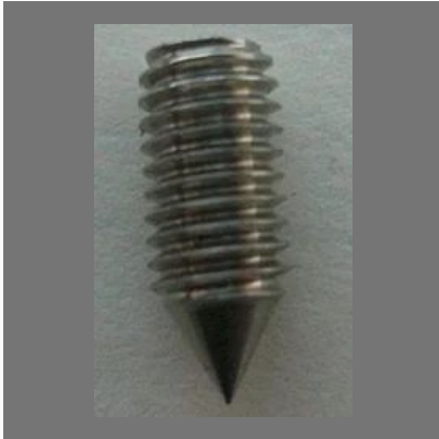
Pencil Point Screw