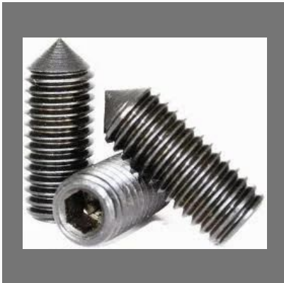
Dock Point Grub Screw