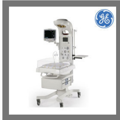
GE Healthcare Baby Warmer Machine