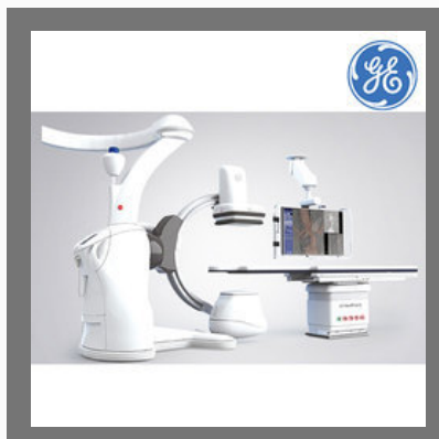
GE Healthcare Discovery IGS 730 System for Hybrid OR