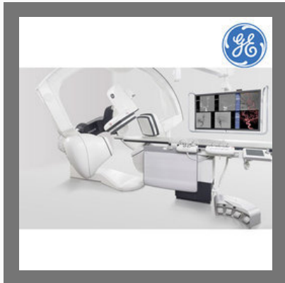
GE Healthcare IGS for Interventional Neuroradiology