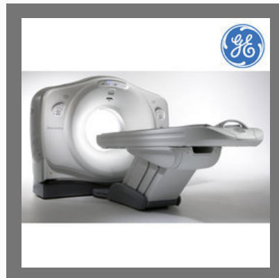
GE Healthcare Discovery CT750 HD Computed Tomography System