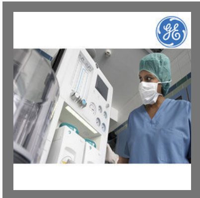
GE Healthcare Anesthesia - Carestation 30