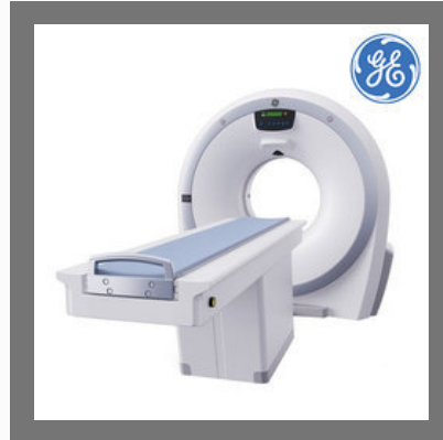
GE Computed Tomography Revolution ACTs ES