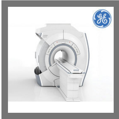
GE Healthcare Magnetic Resonance Imaging Machine