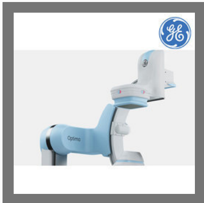
GE Healthcare IGS for Interventional Cardiology