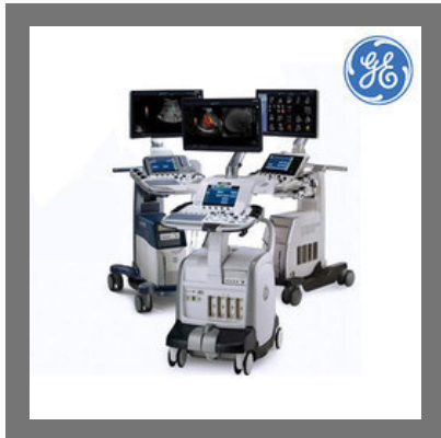
GE Healthcare LOGIQ Vision Series Ultrasound System