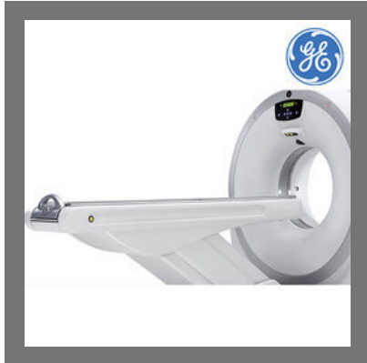
GE Healthcare Computed Tomography Brivo CT385 System