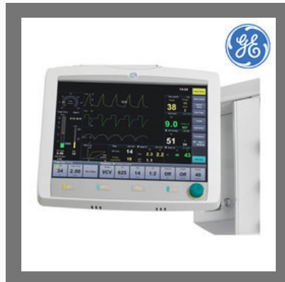
GE Healthcare Anesthesia Avance CS2 with Eco Flow