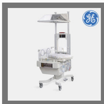
GE Healthcare Giraffe Omni Bed Infant Radiant Warmer