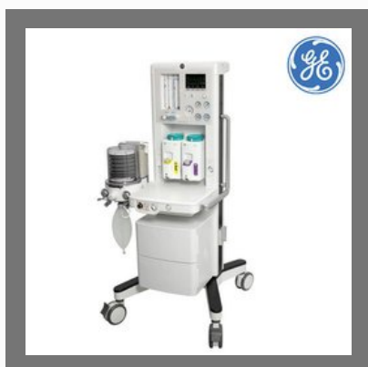
GE Healthcare Carestation 30