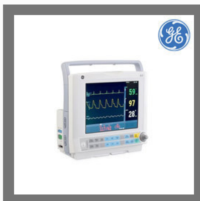
GE Healthcare B20 Patient Monitor