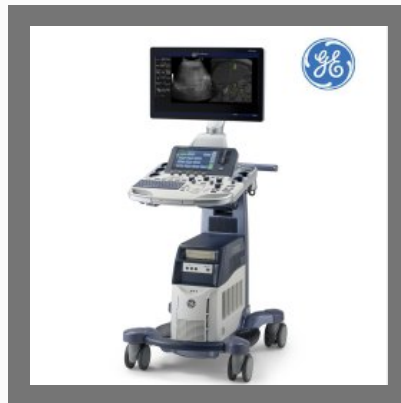
GE Healthcare Logiq S8 XD Clear Used Ultrasound Machine