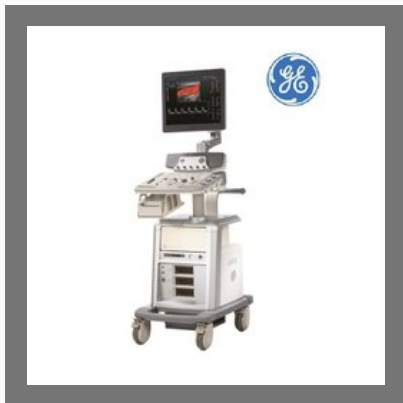
GE Healthcare Logiq P6 Pro Used Ultrasound Machine