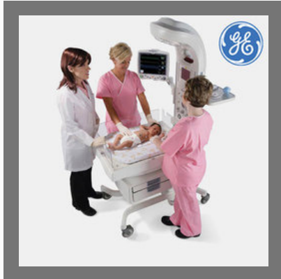
GE Healthcare Giraffe Warmer