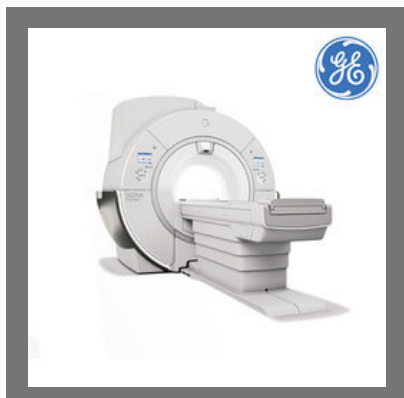
GE Healthcare Signa TM Pioneer 70cm Computed Tomography Machine