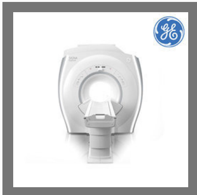
GE Healthcare Magnetic Resonance Imaging Machine