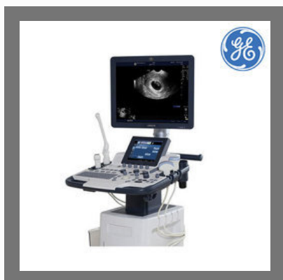
GE Healthcare LOGIQ Forward Series GE Ultrasound Systems