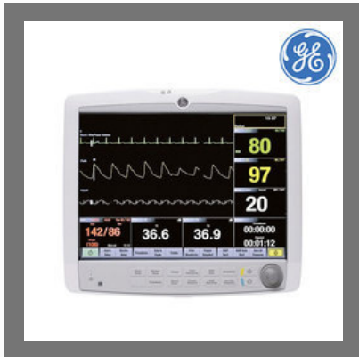
GE Healthcare Carescape Monitor B850