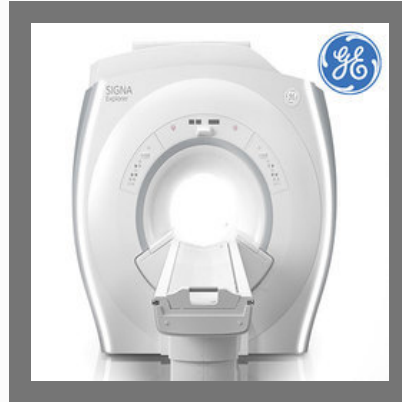
GE Healthcare Magnetic Resonance Imaging Machine