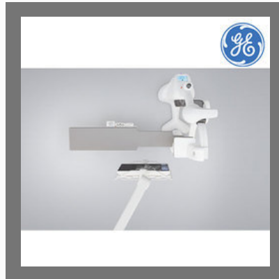
GE Healthcare IGS for Interventional Radiology