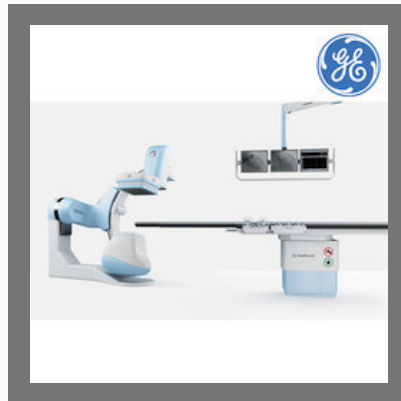
GE Healthcare IGS for Interventional Radiology System