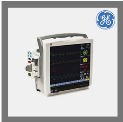
GE Healthcare Carescape Monitor B450