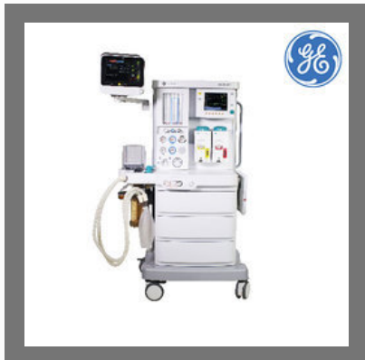
GE Healthcare 9100C Anesthesia Machine