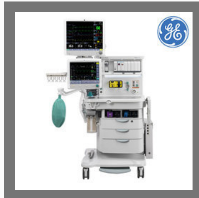
GE Healthcare Aisys CS2 Anesthesia Machine