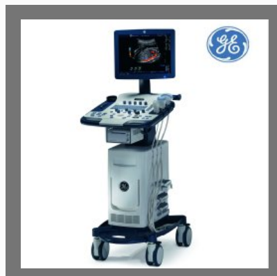
GE Healthcare Logiq V5 Used Ultrasound Machine