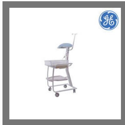
GE Healthcare Lullaby Warmer Prime