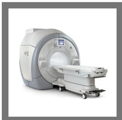
1.5T GE Healthcare Magnetic Resonance Imaging