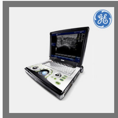
GE Healthcare LOGIQ e Ultrasound Equipment