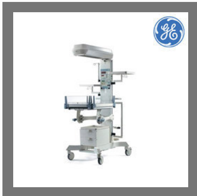
GE Healthcare Lullaby Warmer