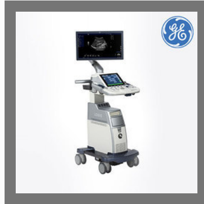
GE Healthcare Logiq P-Series Ultrasound System