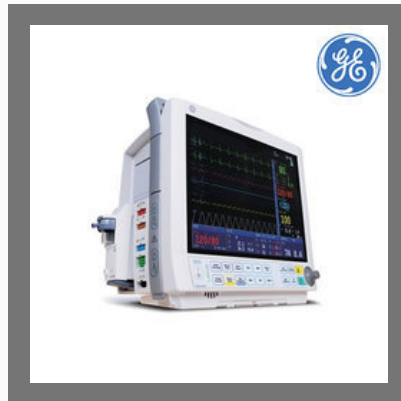
GE Healthcare B40 Patient Monitor