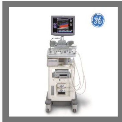
GE Healthcare Logiq P5 Premium Used Ultrasound Machine