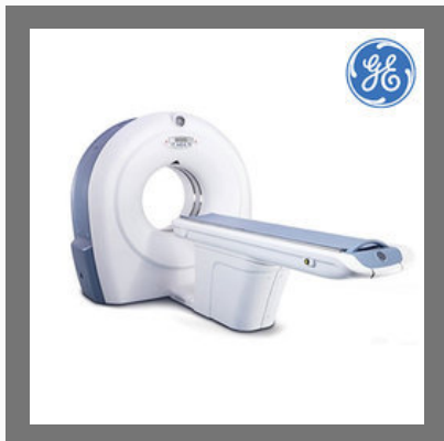
GE Healthcare Brivo CT325 CT Scan Machine