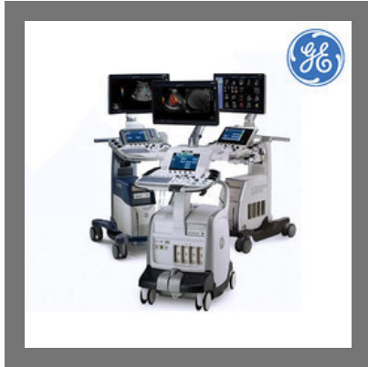
GE Healthcare LOGIQ XDclear Family Ultrasound Systems