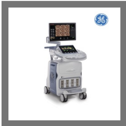
GE Healthcare Voluson E6 BT17 Used Ultrasound Machine