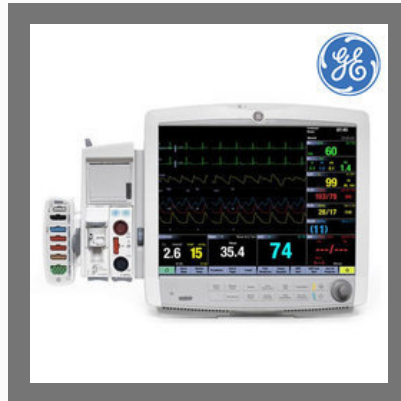
GE Healthcare Carescape Monitor B650