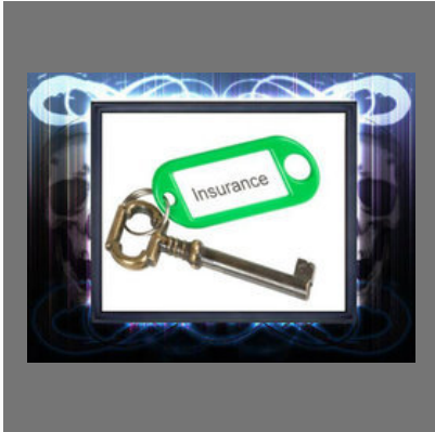
Advice On Insurance Buying