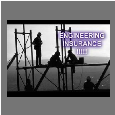
Claims Settlement On Behalf Of Clients