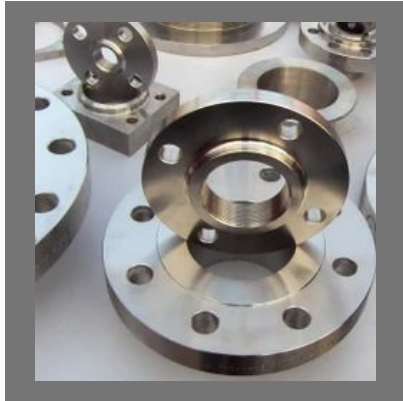
Stainless Steel Flanges