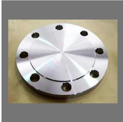
Raised Face Flanges