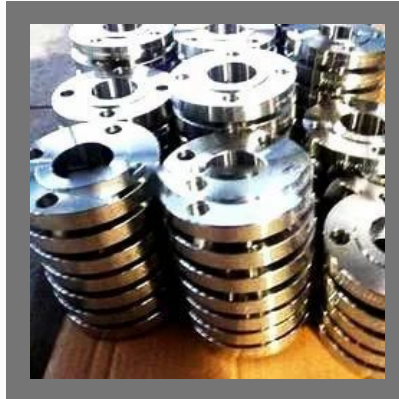
Slip On Flanges