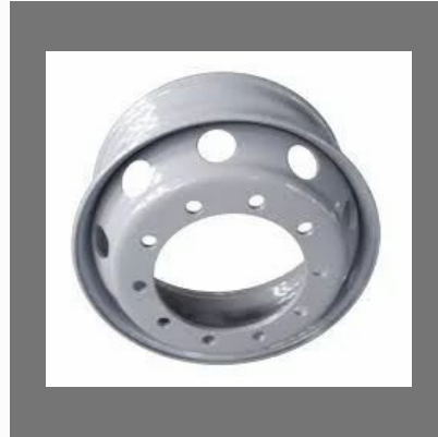
Tractor Trolley Wheel Plate