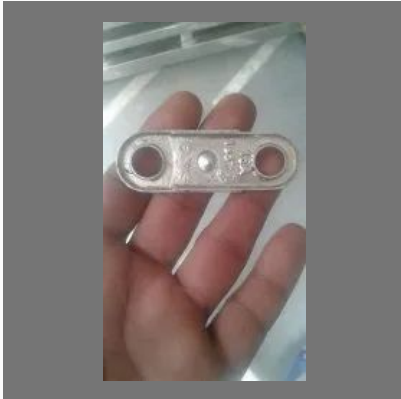
Fusible Link For Fire Dampers