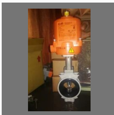
Kitz Motorized Butterfly Ip67