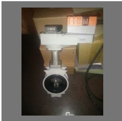
Kitz Motorized Butterfly Valve IP54