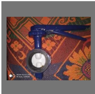
CNR AI. Manual Butterfly Valve Industrial