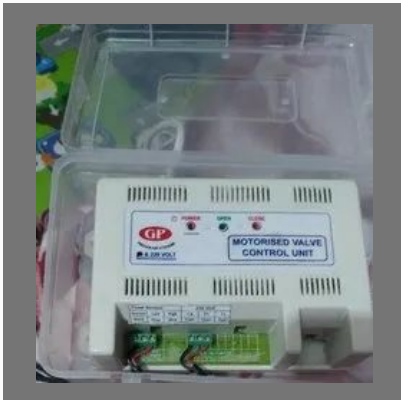
Automatic Motorized Valve Controller with ip67 protection.