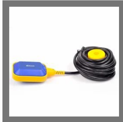
Cable Float Switch 3 Meters