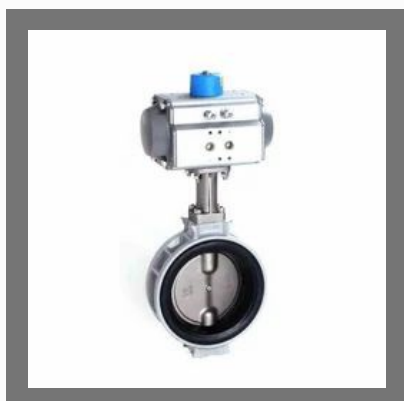
Kitz Motorized Butterfly Valve