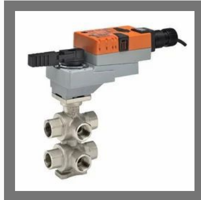
Belimo Characterized Control Valve