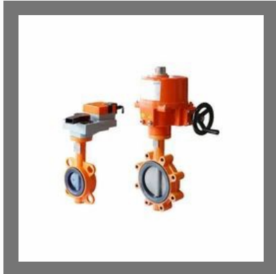
Belimo Motorized Butterfly Valve