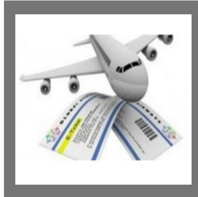
Domestic Air Ticketing