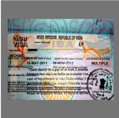
International Air Ticketing