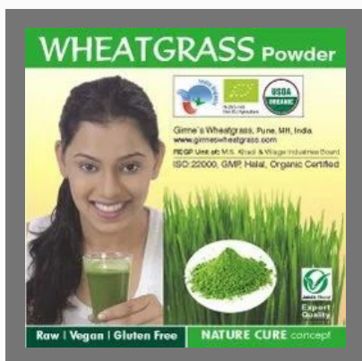
Wheat Grass Powder