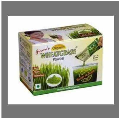
Wheat Grass Powder Sachet