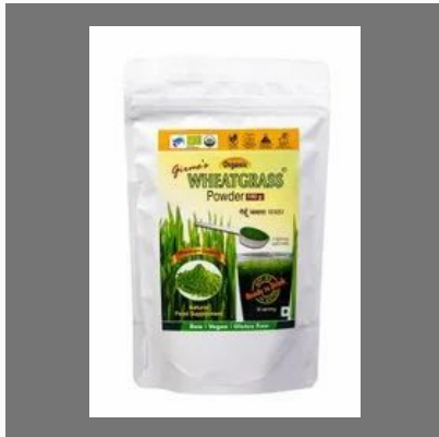
Wheat Grass Powder 100 Gm