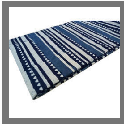
Textile Hand Block Printed Fabric