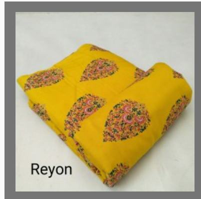
Hand printed fabric rayon