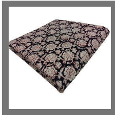
Fancy Kalamkari Cotton Fabric