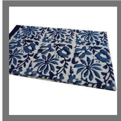
Indigo Kalamkari Cotton Fabric