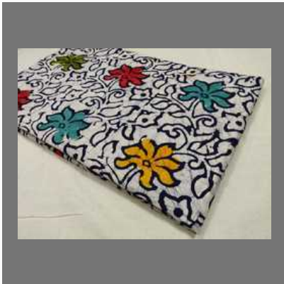
Printed Cotton Fabric