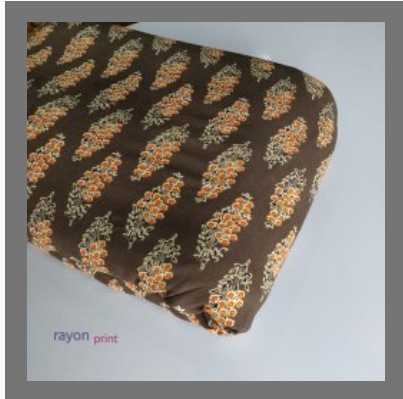
Rayon Printed Fabric