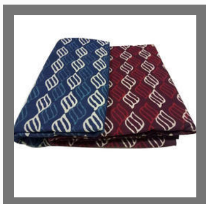
Dabu Printed Kalamkari Fabric