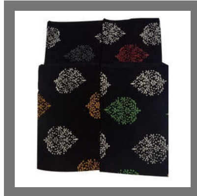
Kalamkari Ladies Dress Material