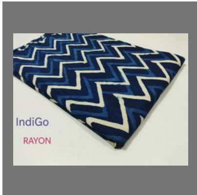
Rayon Printed Fabrics