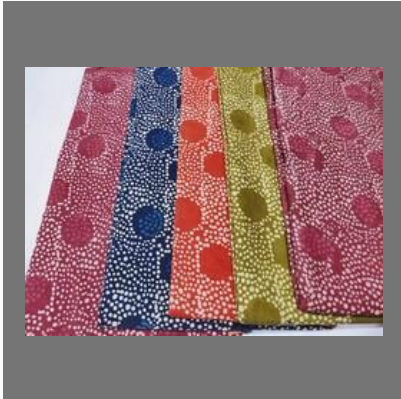
Dabu Printed Cotton Fabric