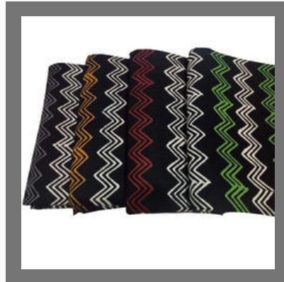
Printed Ladies Dress Material