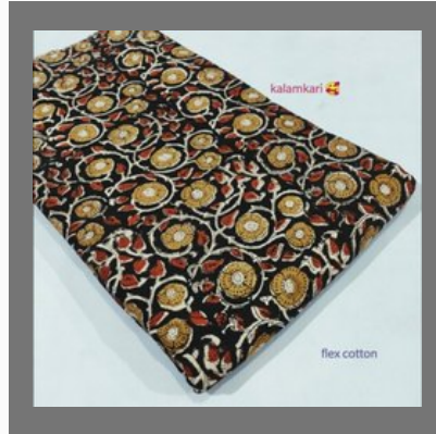
Cotton Flex Block Print Fabric