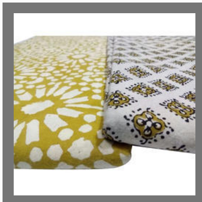
Hand Block Printed Kalamkari Fabric