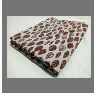
Bagru Printed Cotton Fabric