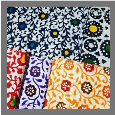
Cotton Print Fabrics