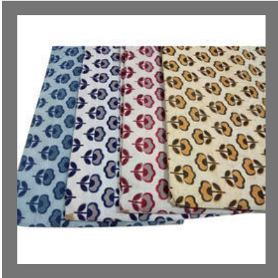
Kalamkari Printed Cotton Fabric