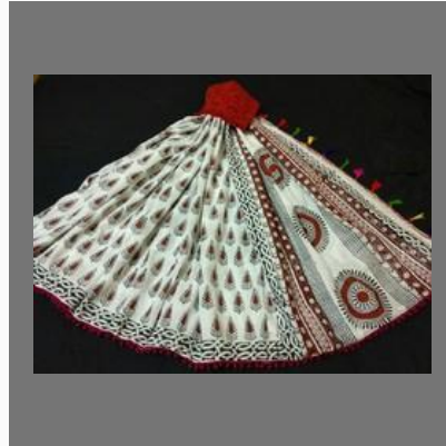
Cotton Hand Block Printed Saree