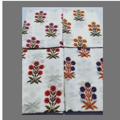
Boota Printed Cotton Fabric