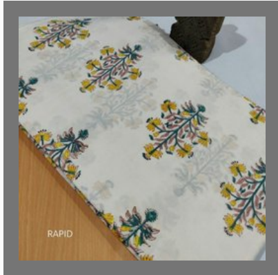
Sanaganeri Block Print Fabric