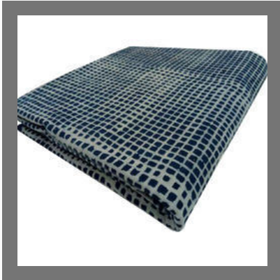
Designer Hand Block Printed Fabric