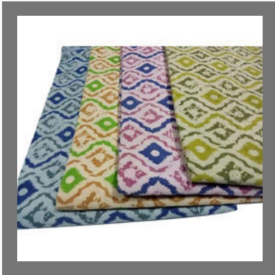
Designer Kalamkari Cotton Fabric