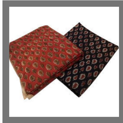
Fancy Hand Block Printed Fabric