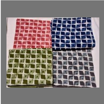
Dabu Ladies Dress Material