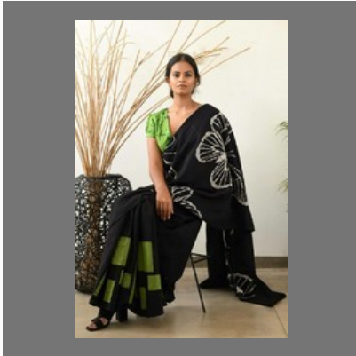
Batik Printed Cotton Saree