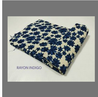
Rayon Handblock Fabric