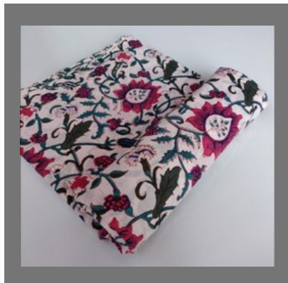
Block Print Sanaganeri Fabric