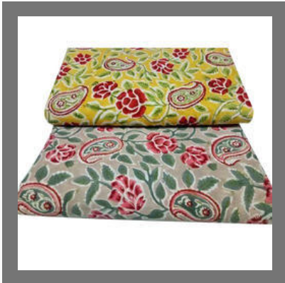
Rapid Kalamkari Printed Dress Material