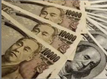
Foreign Exchange Remittances & Transfers (fera)