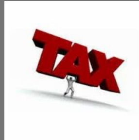
Income Tax Assistance