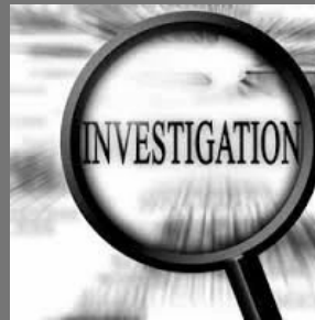
Audit & Investigation Of Accounts