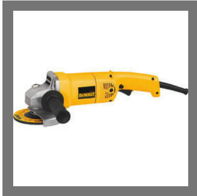
DW831 Angle Grinder