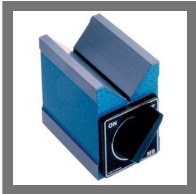
Dual Vee Magnetic V Block