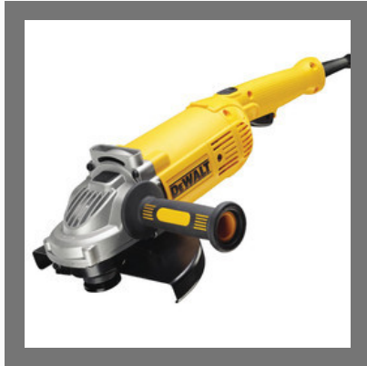
DWE492 Large Angle Grinder