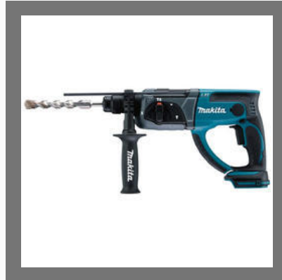
Makita Hammer Drill