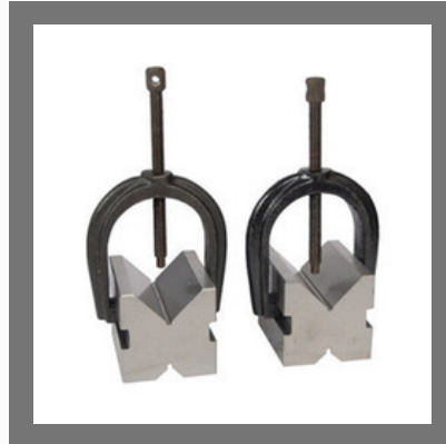
Precision V Block And Clamp