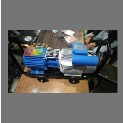
Car Washer Pump