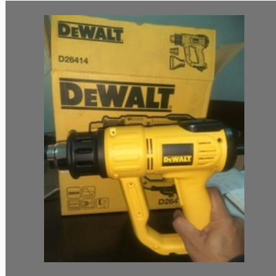
Digital Hot Air Gun