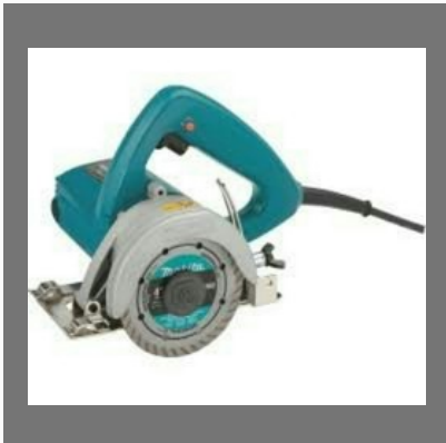
Marble Cutting Machine