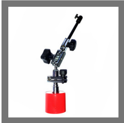
Universal Magnetic Indicator Holder