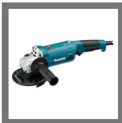
Makita 5 Inch Angle Grinder