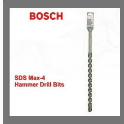
SDS Max Drill Bits