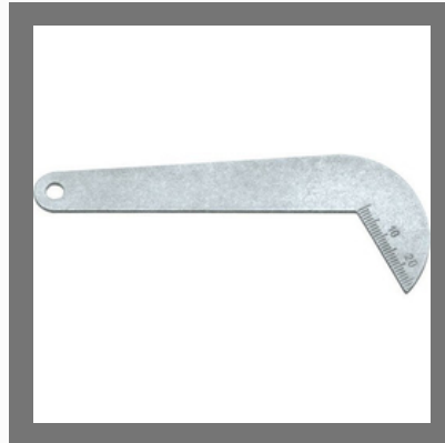
Twist Drill Grinding Gauge