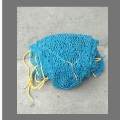
Safety Nets For Building