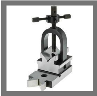
Precision V Block And Clamp