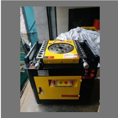
Bar Bending Machine