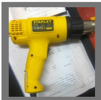
Hot Air Guns