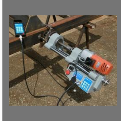
Rail Drilling Machine