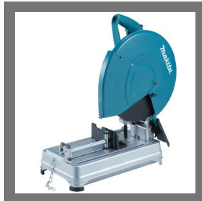
Makita Cut Off Saw