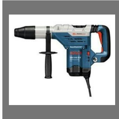
Combination Hammers GBH5-40DCE