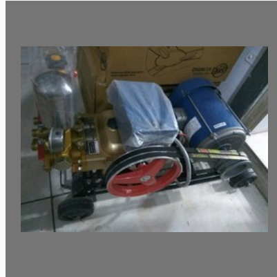
Commercial Car Washer