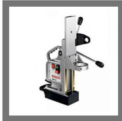
Magnetic Base Drill Stand