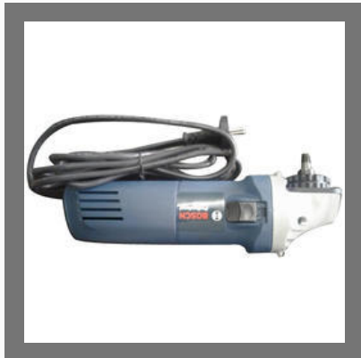
Small Angle Grinder