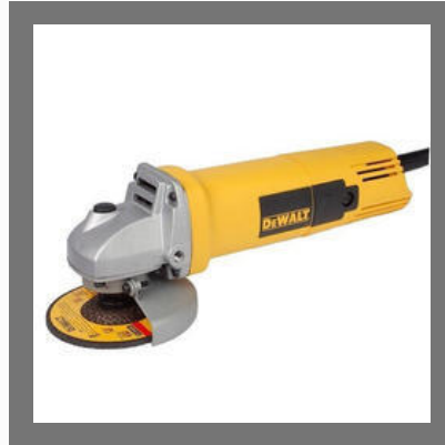
DW801 Angle Grinder