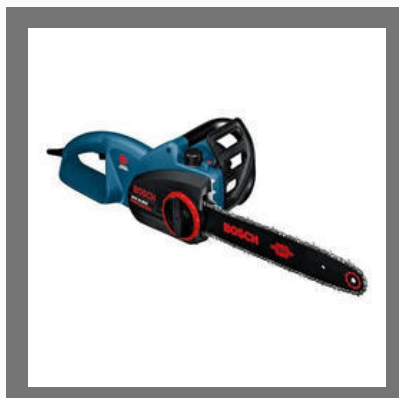
GKE 35 BCE Chainsaw