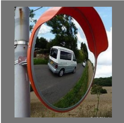
Safety Convex Mirror