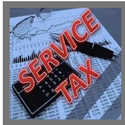
Service Tax Consultancy Service