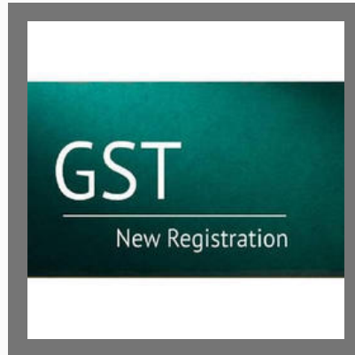
GST Registration Consultancy Service