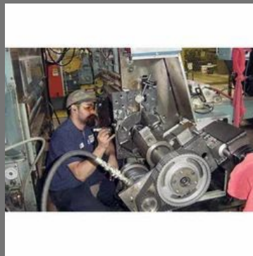
CNC Machine Service Support