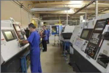
Cnc Machine Services support