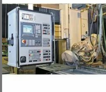
CNC Machine Panel Retrofitting Service