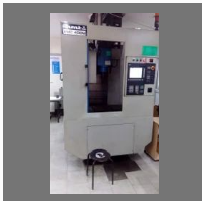
VMC Machine Retrofitting Services