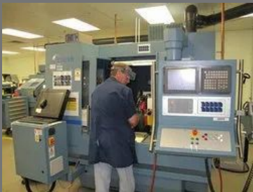
CNC Machine Upgradation