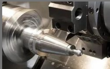
CNC Turning Center Machinin Service