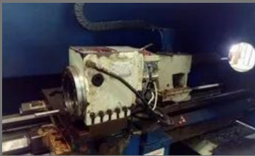
Turret Repairing Services