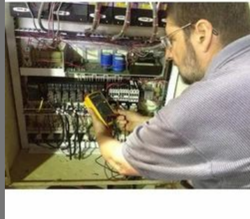
CNC Repairing Service