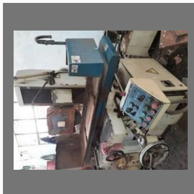
Surface Grinding Machine Service