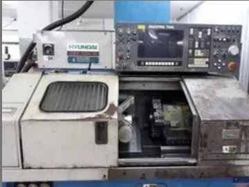
CNC Machine Maintenance Service