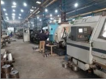
CNC Machine Annual service contract