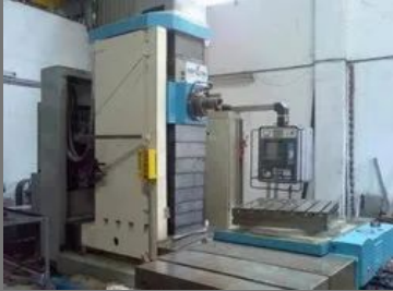
HMC Machine Repairing Service