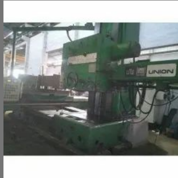
Milling Machine Repairing Services