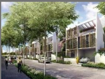
Fully Furnished, Airconditioned, Serviced Luxury Villas