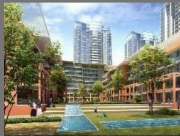
Air-Conditioned Serviced Luxury Attached-Villas