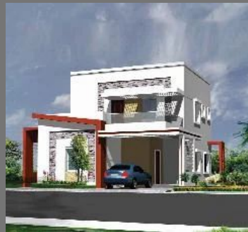
Villas in a Valley