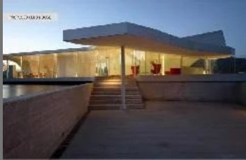
Gated Farm House Community