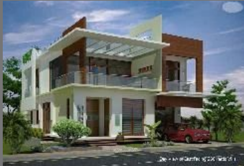
Premium Villas at Lowest Prices Possible In Hyderabad