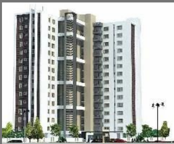
Signature Apartment Project- Bannerghatta Road, Bengaluru