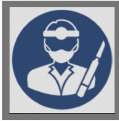
General Surgery Treatment Services