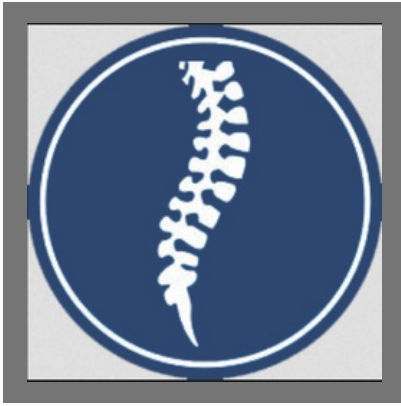
Spine Surgeries Treatment Services