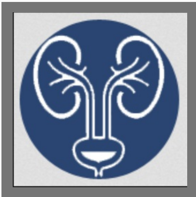
Urology Treatment Services