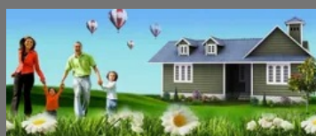
Home Insurance Service