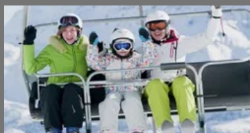
Travel Insurance Service