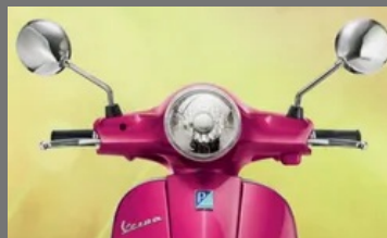
Two Wheeler Insurance Service