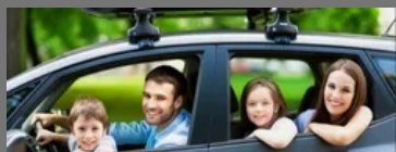
Car Insurance Service