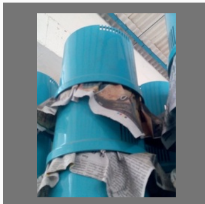
Plastic Injection Moulding