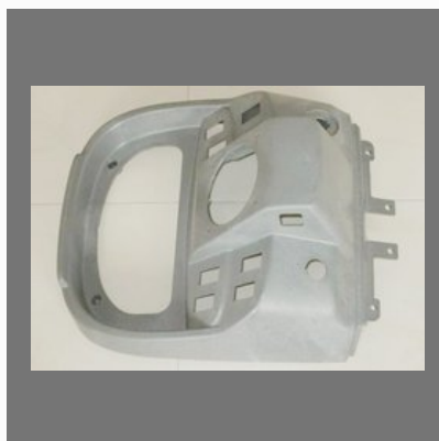
Industrial Injection Moulding Component