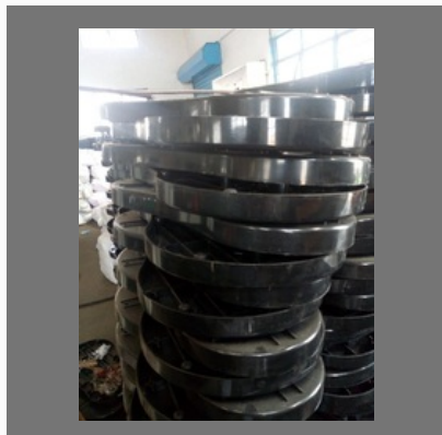
Plastic End Cap