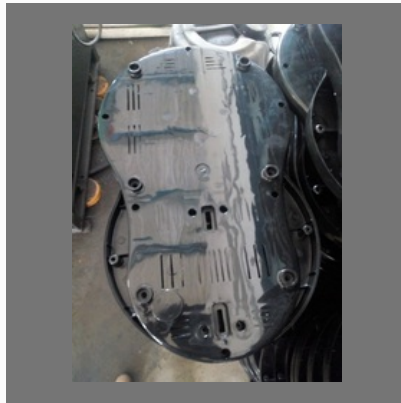
Wet Grinder Bottom Plastic Parts