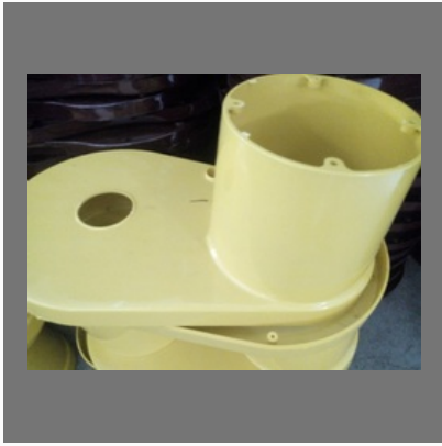
Wet Grinder Plastic Body