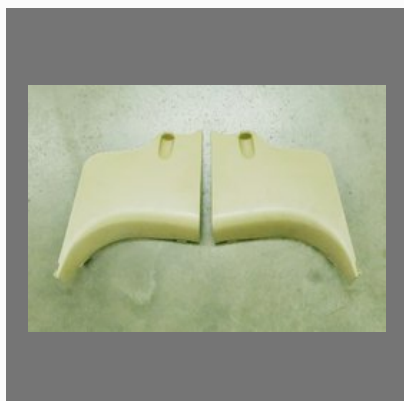
Injection Moulding Component