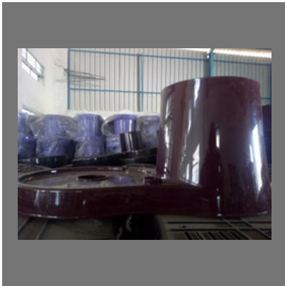
Table Wet Grinder Plastic Body