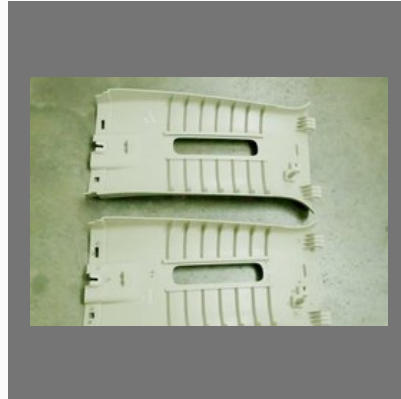
Injection Moulding Machine Component