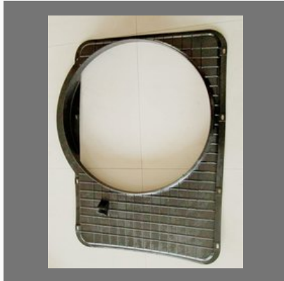
Plastic Injection Moulding Component