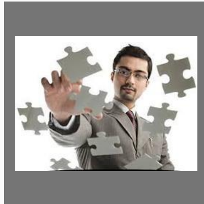
HR Consulting Service