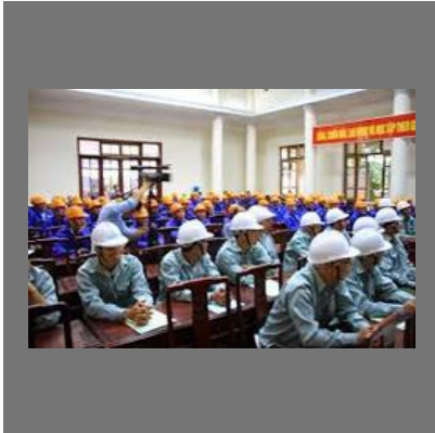
Recruitment Campaign Management Services