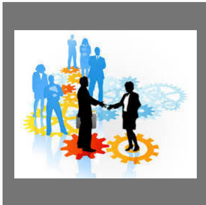
Manpower Recruitment Consultancy Services