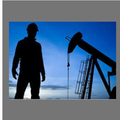
Oil & Gas Recruitment Services