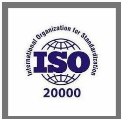
ISO 20000 Certification Service