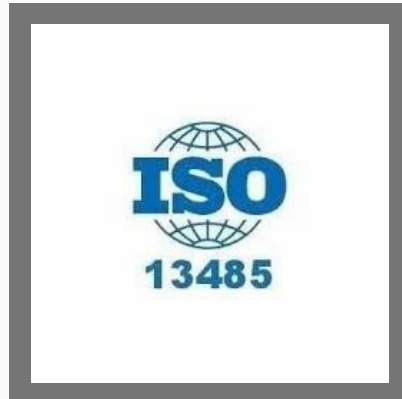
ISO 13485 Certification Service