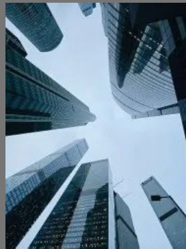
Green Building Certifications