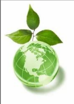
Environmental Management Certification Service