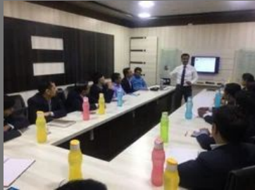
Corporate Training Services