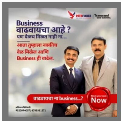
Business Coaching -