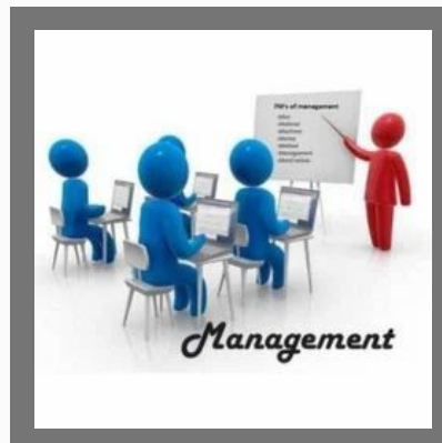
Lean Management Training