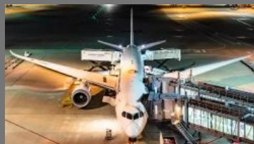
AS 91000 - QMS for Aerospace Industry