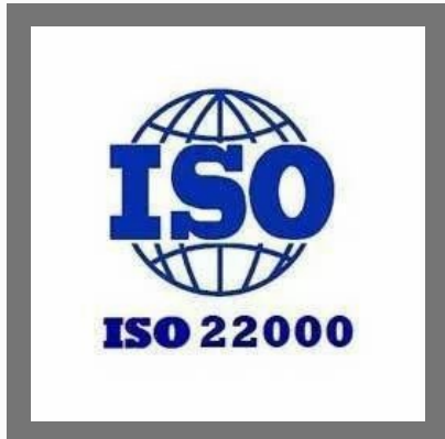
Food Safety ISO 22000 Certification Service