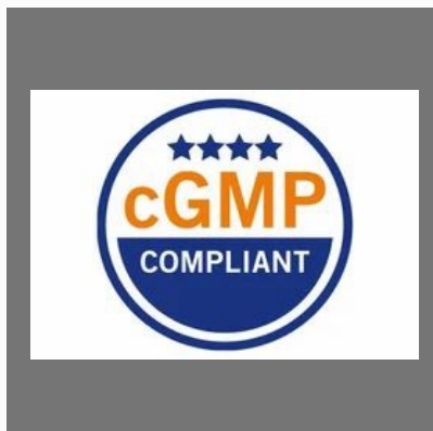
cGMP Certification Service