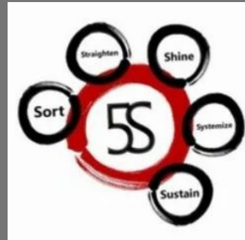
5 S Training Service