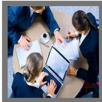
Productivity Bench Marking