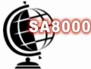
Social Accountability Standard Certification Service