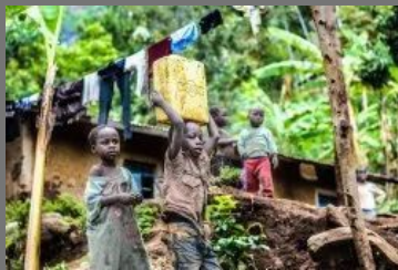
CSR - Corporate Social Responsibility