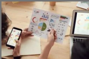
Energy Audit Service