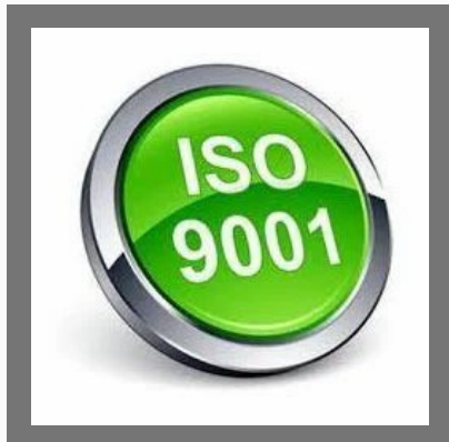
ISO 9001 Certification Service