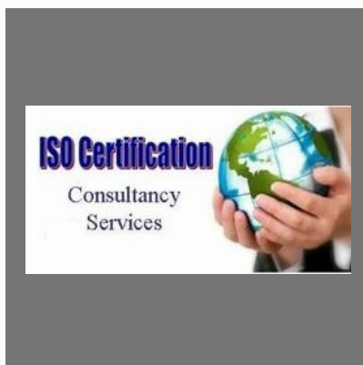
ISO Certification Consultancy Services