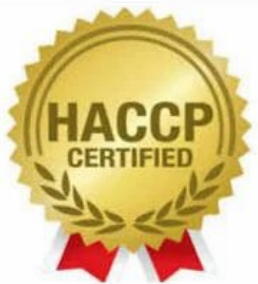
HACCP Certification Service