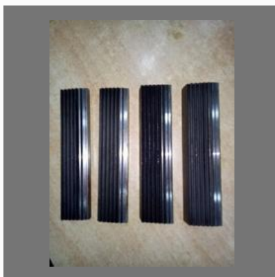
Thread Chaser Tool