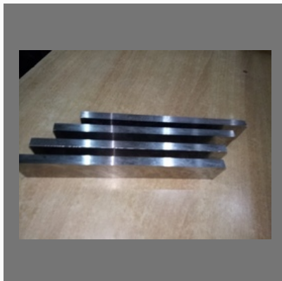
Carbide Cutting Tool