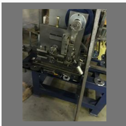
Spring Washer Making Machine