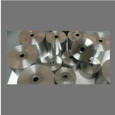
Carbide Cold Heading Bolt Die