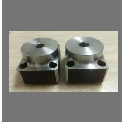
Carbide Cold Heading Die