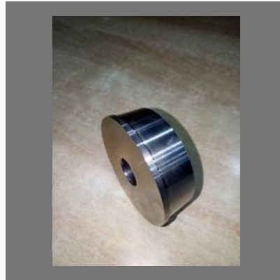
Carbide Form Cutter Die