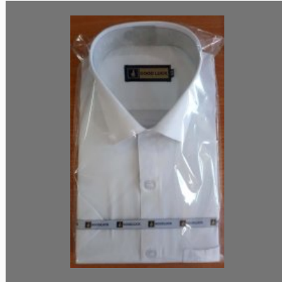
Good Luck Minister White Shirts