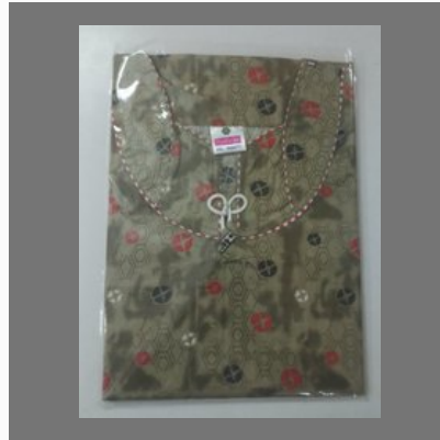
Ladies Round Neck Nighty