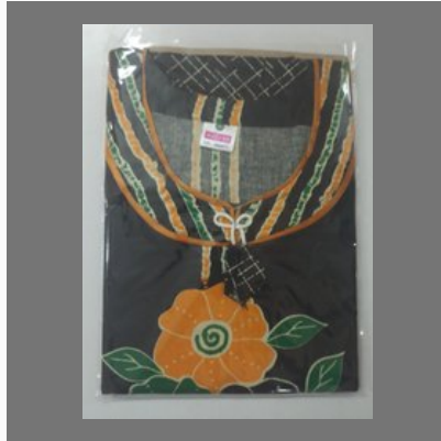
Round Neck Nighty