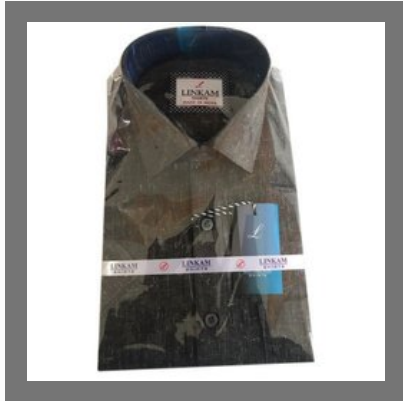
Men Cotton Casual Shirt