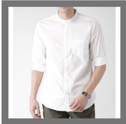
Men Cotton White Shirt