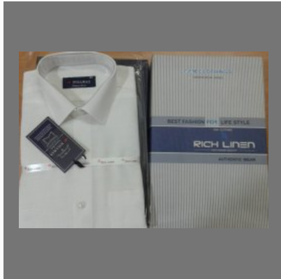
Rich Linen White Shirts