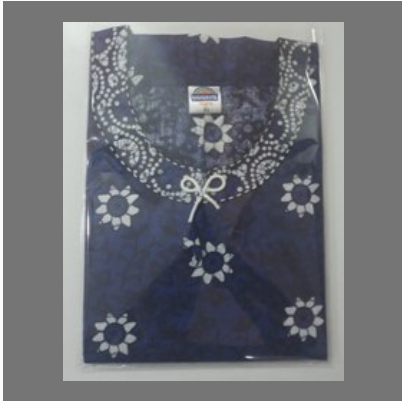
Ladies Cotton Nighty