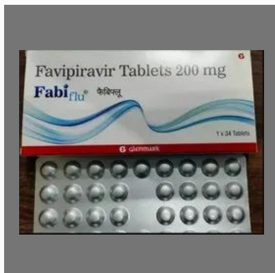
FabiFlu Favipiravir 200 mg Tablets