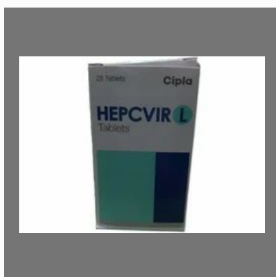
Hepcvir L Tablet