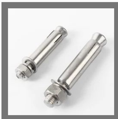
Stainless Steel Anchor Bolt