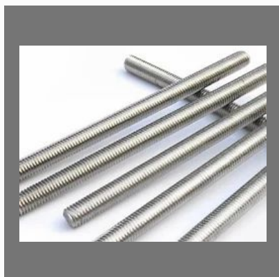
MS Fully Threaded Stud