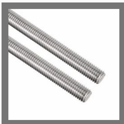
SS Fully Threaded Stud