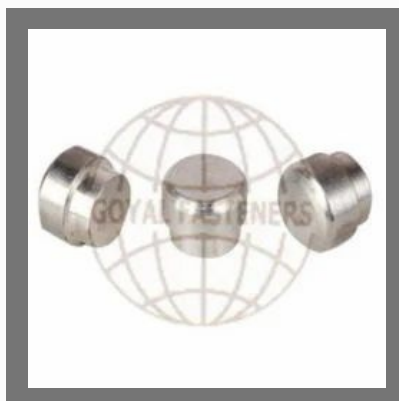
SS Cabinet Knobs