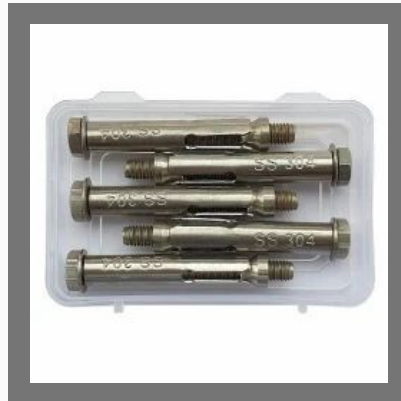
SS Sleeve Fasteners