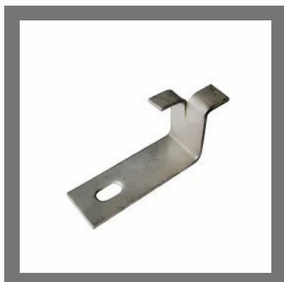
SS304 Polished Stainless Steel Stone Cladding Clamp