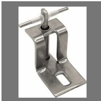
Stone Cladding Clamps