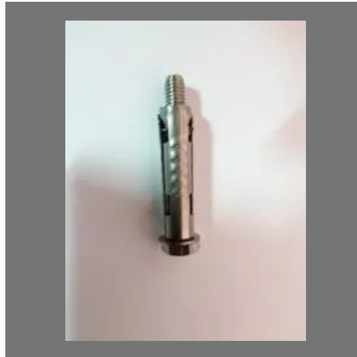
SS Concrete Anchor