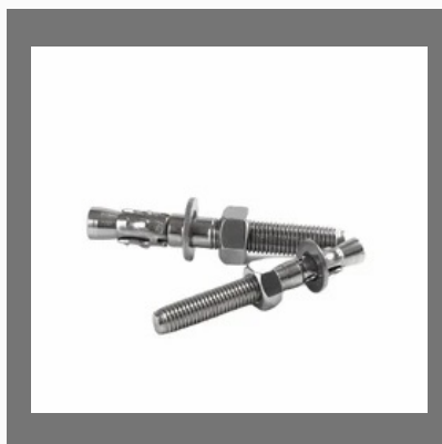
Bright Stainless Steel Wedge Anchors