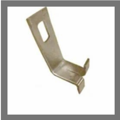
SS Wet Cladding Clamps