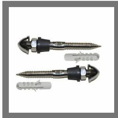
Industrial Rack Bolts