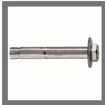
Metal Zebra Anchor Bolt