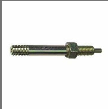
SS Pin Type Anchor Bolt