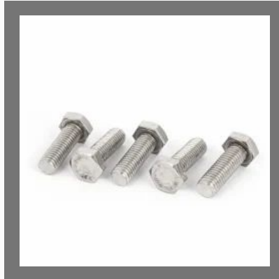
Thread Rods And Fasteners