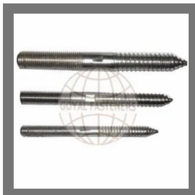
Metal Rack Bolt