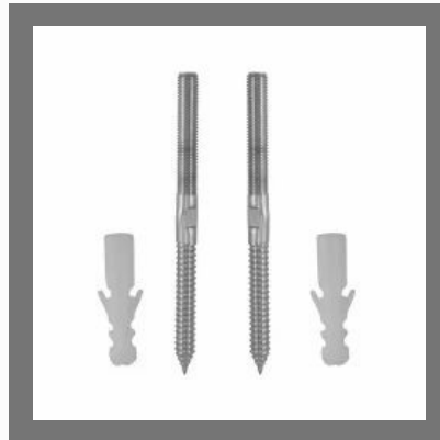
Ss Rack Bolt