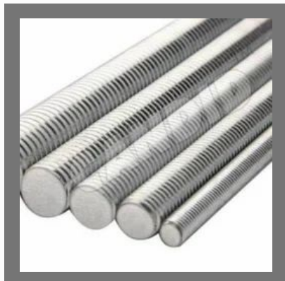
Ms Full Threaded Rod