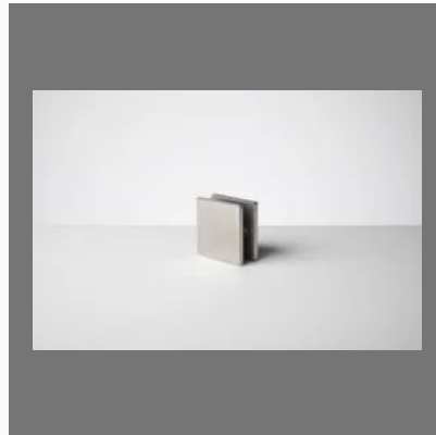
SS Cladding Clamps