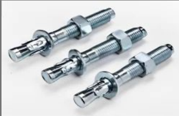
SS Round Anchor Bolt