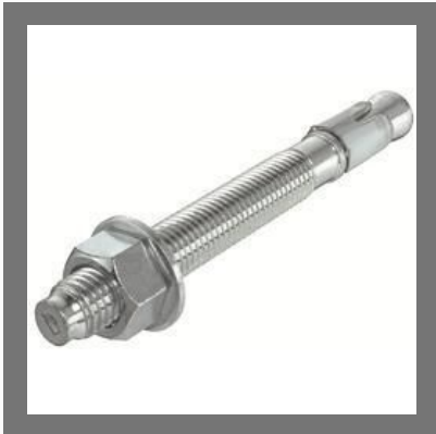
SS Mechanical Anchors