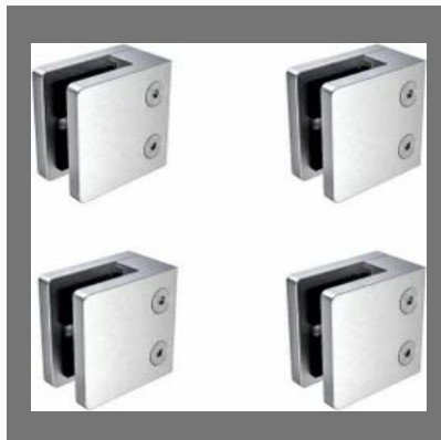
SS Glass Fittings