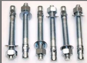
SS304 Wedge Anchor Bolts