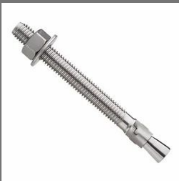
Stainless Steel Wedge Anchor Bolt