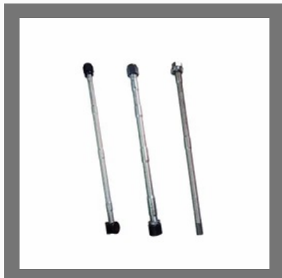
Breakers Through Bolt