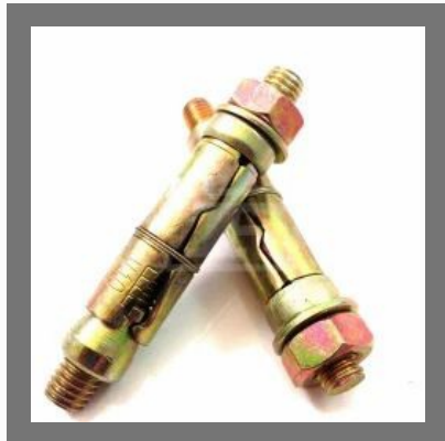
Metal Projection Bolt