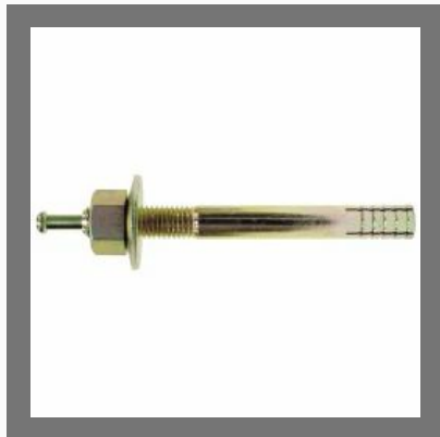
Pin Type Anchor Bolt