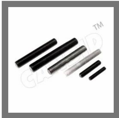
Metal Threaded Rods