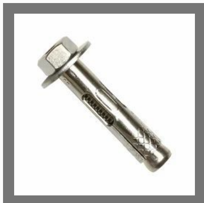
Stainless Steel Anchor Bolts Long Type