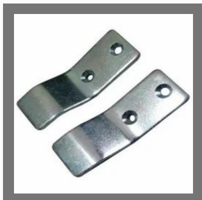
SS Silver Clamps