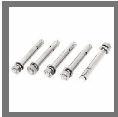
Sleeve Anchor Fastener