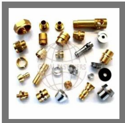
Industrial Precision Turned Component