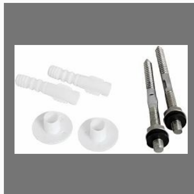
Stainless Steel Rack Bolt