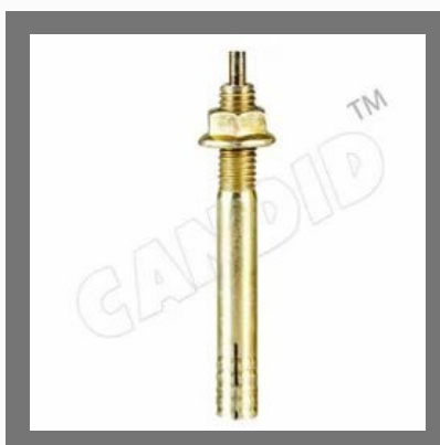
M10 Metal Zebra Anchor Bolt