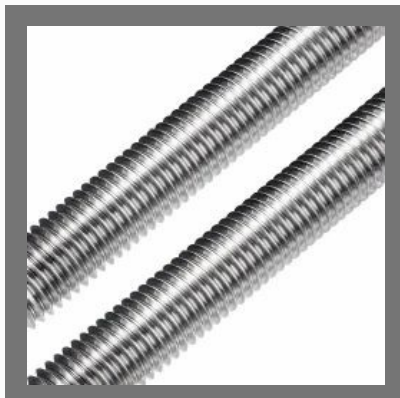
MS Thread Rod