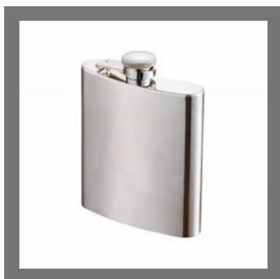
Stainless Steel Hip Flask