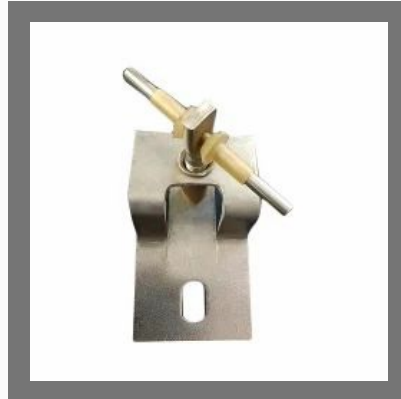
SS Chair Cladding Clamps