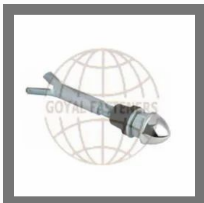
Wooden Y Bolts