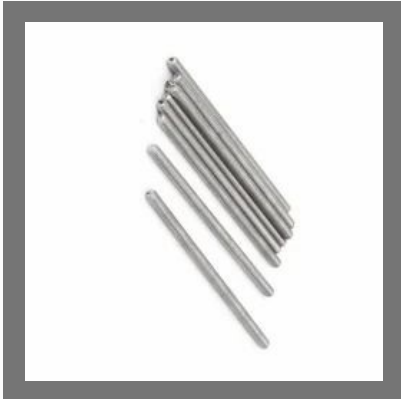
Polished Fully Threaded Studs