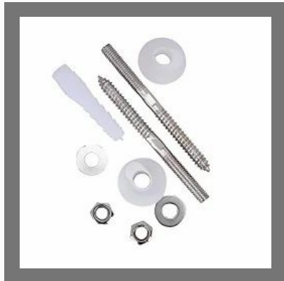
Mild Steel Long Rack Bolt