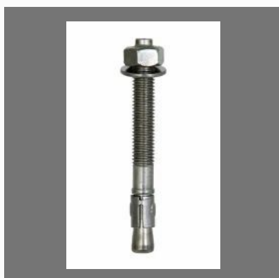
MS Anchor Bolts