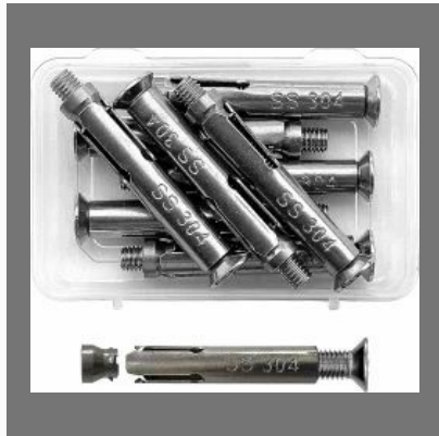
Industrial Stainless Steel Anchor Fasteners