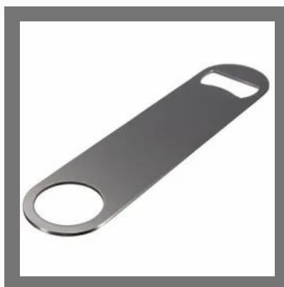
SS Bottle Opener