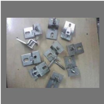
Metal Cladding Clamps