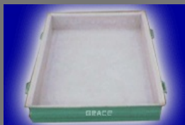
Custom Molding & Fabrication