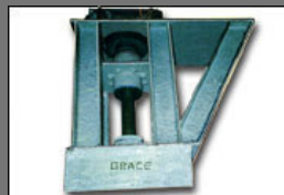
Anti Corrosive Coating Product