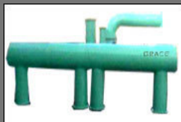
Hoods, Stacks, & Dampers