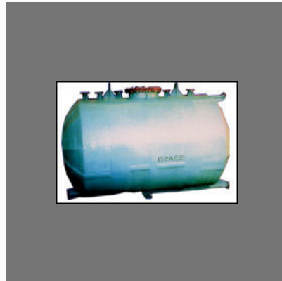
Pressure Vacuum Vessels