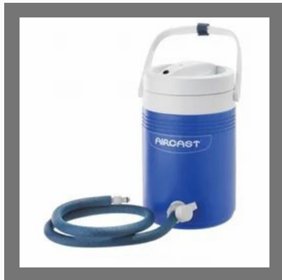
AirCast Cryo Cuff Cooler