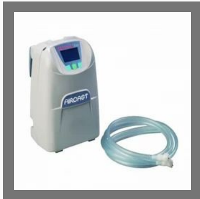
AirCast Venaflo Elite Vascular System