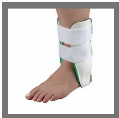
Aircast Ankle Brace