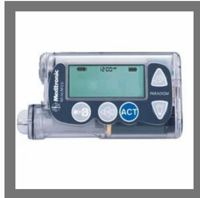
Paradigm 715 Insulin Pump