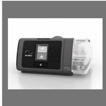
Resmed Airstart 10 APAP CPAP