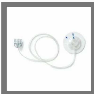
Medtronic Infusion Set