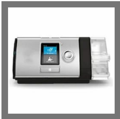
Resmed LUMIS 150 VPAP ST BiPAP