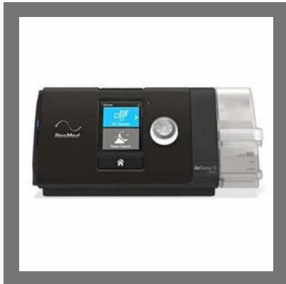
Airsense 10 Autoset Auto CPAP Machine, Airsense 10