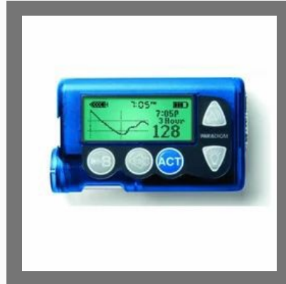
Paradigm Real Time 722 Insulin Pump