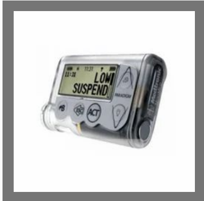
Paradigm VEO 754 Insulin Pump