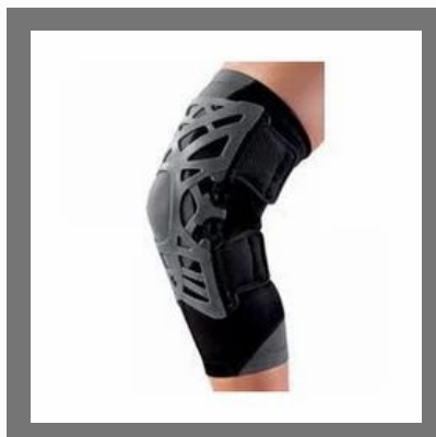
Reaction Knee Brace