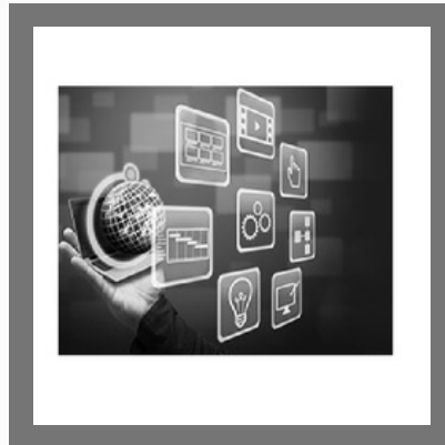
E Learning Services