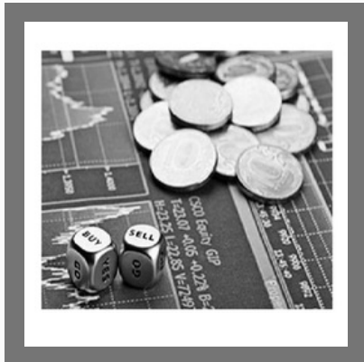
Trade Finance Services