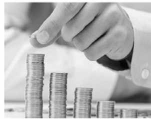
Greenback Advisory Services