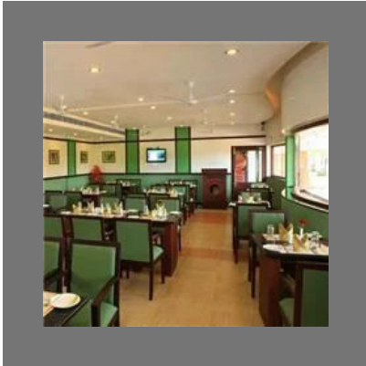
Dining & Meetings Service