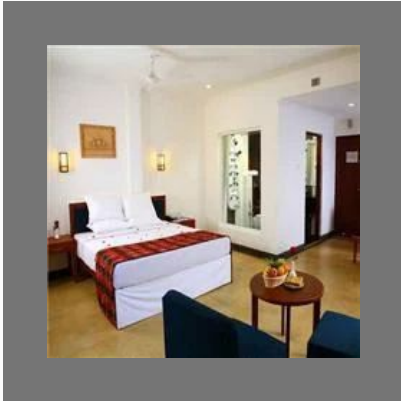
Superior Room Service