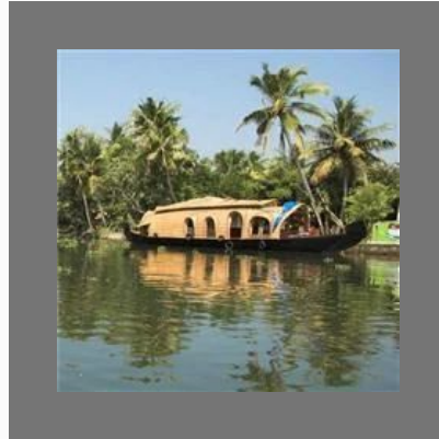
Kerala Tour Package Service