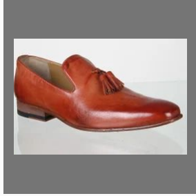
Mens Formal Shoes