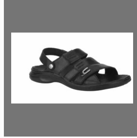
GD 1757115 BLACK