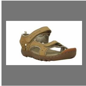
GD 1609114 CAMEL