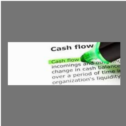
Cash Flow Management Services