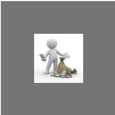
Investment Planning Services