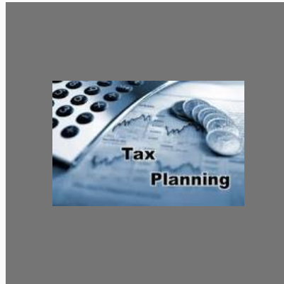
Tax Planning Services