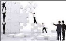
Deeds Drafting Services